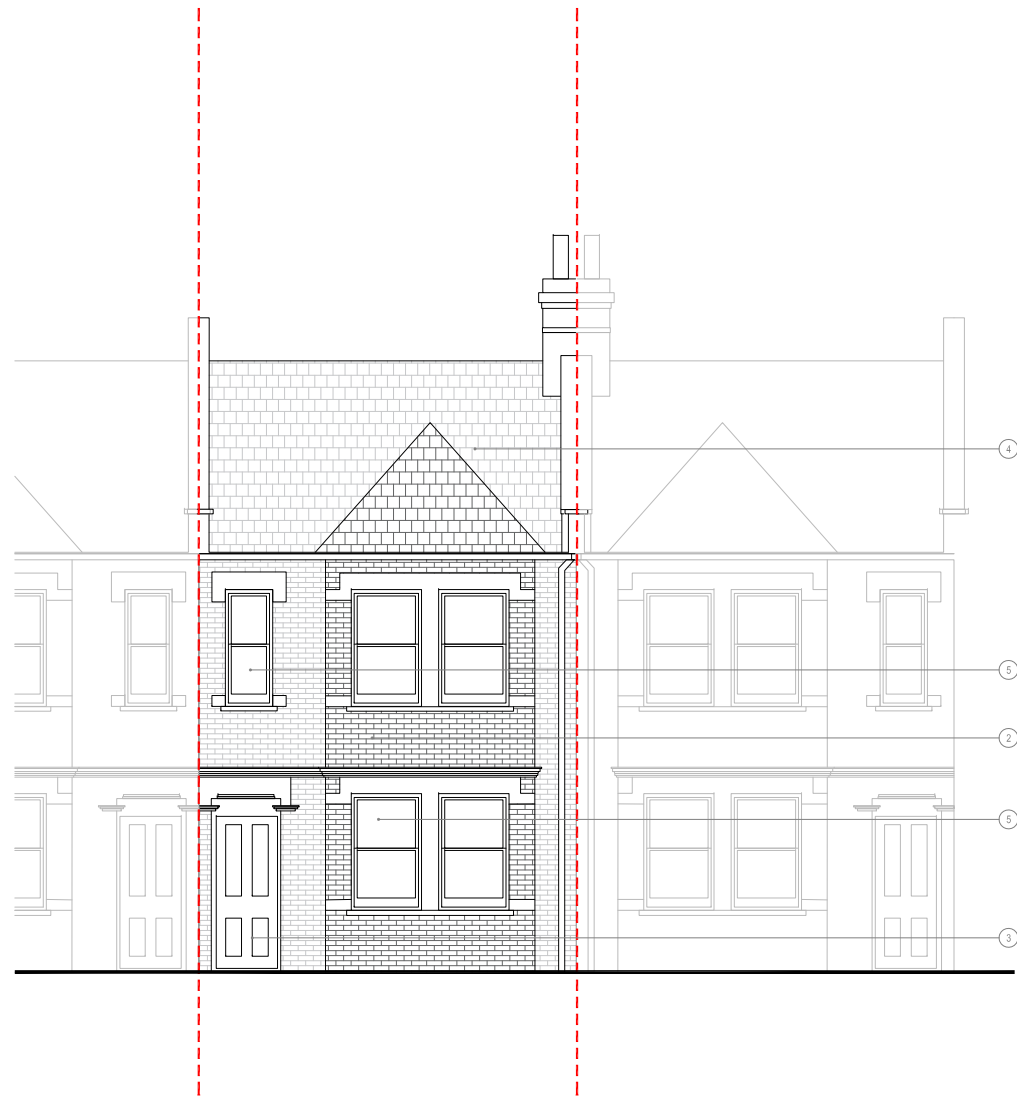
1 Existing Front Elevation SCALE 1:100