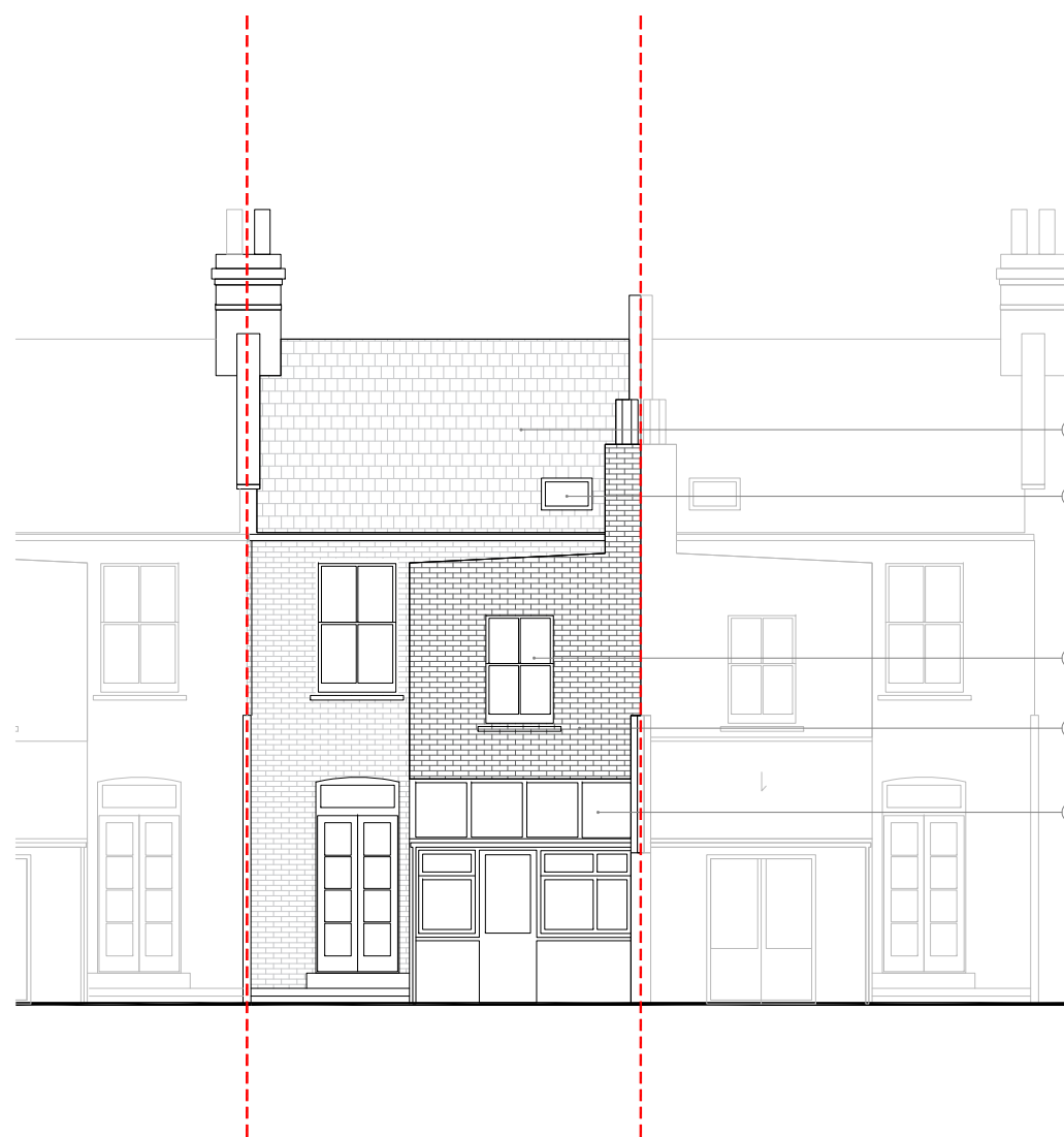
2 Existing Rear Elevation SCALE 1:100