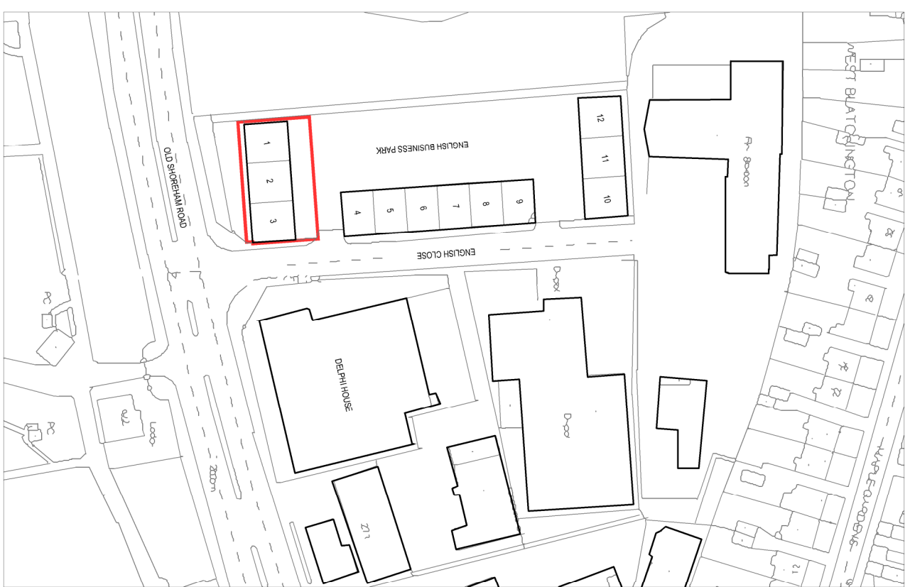
Existing site location plan Scale 1:1250@A3