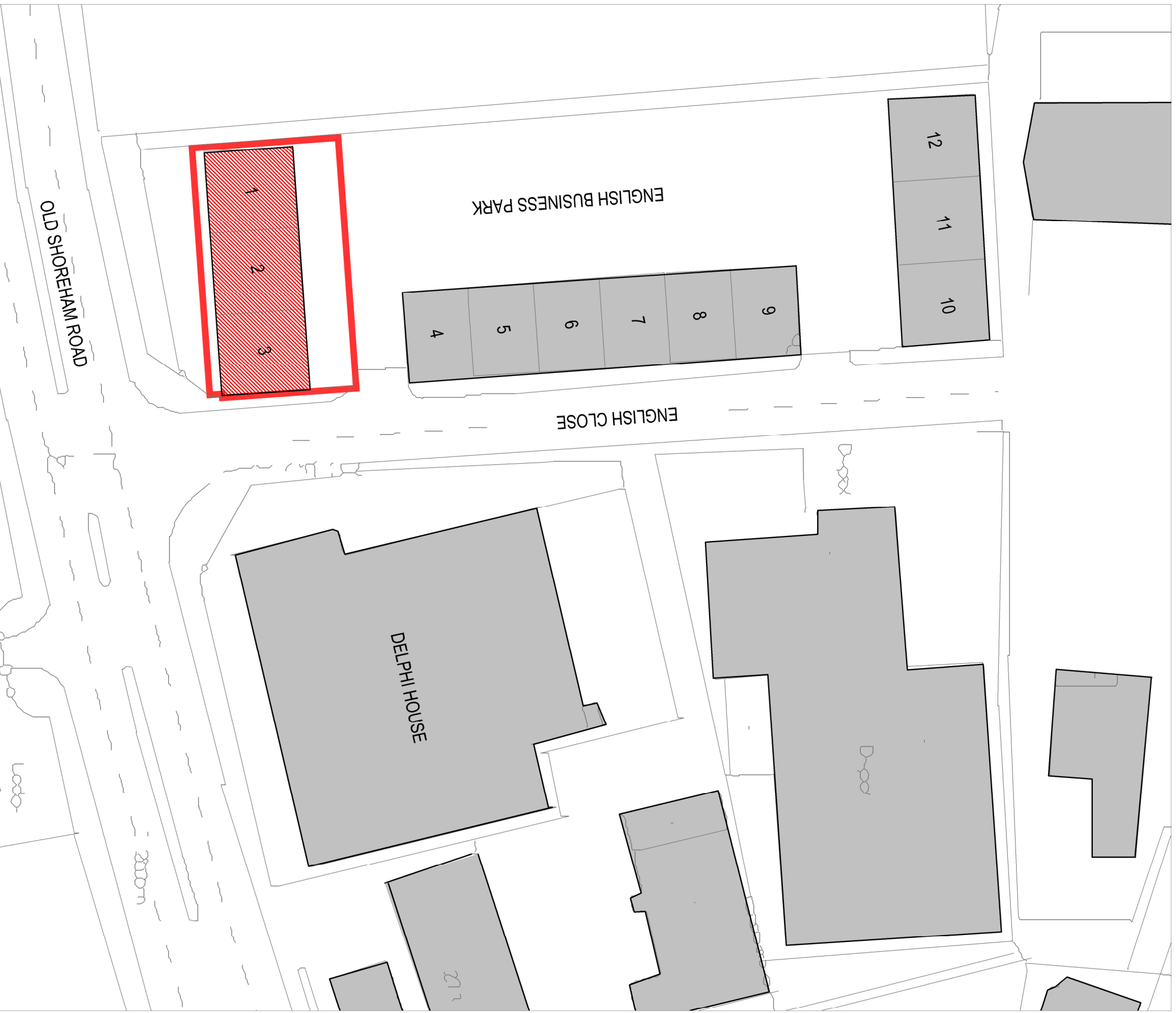
Proposed block plan Scale 1:500@A3