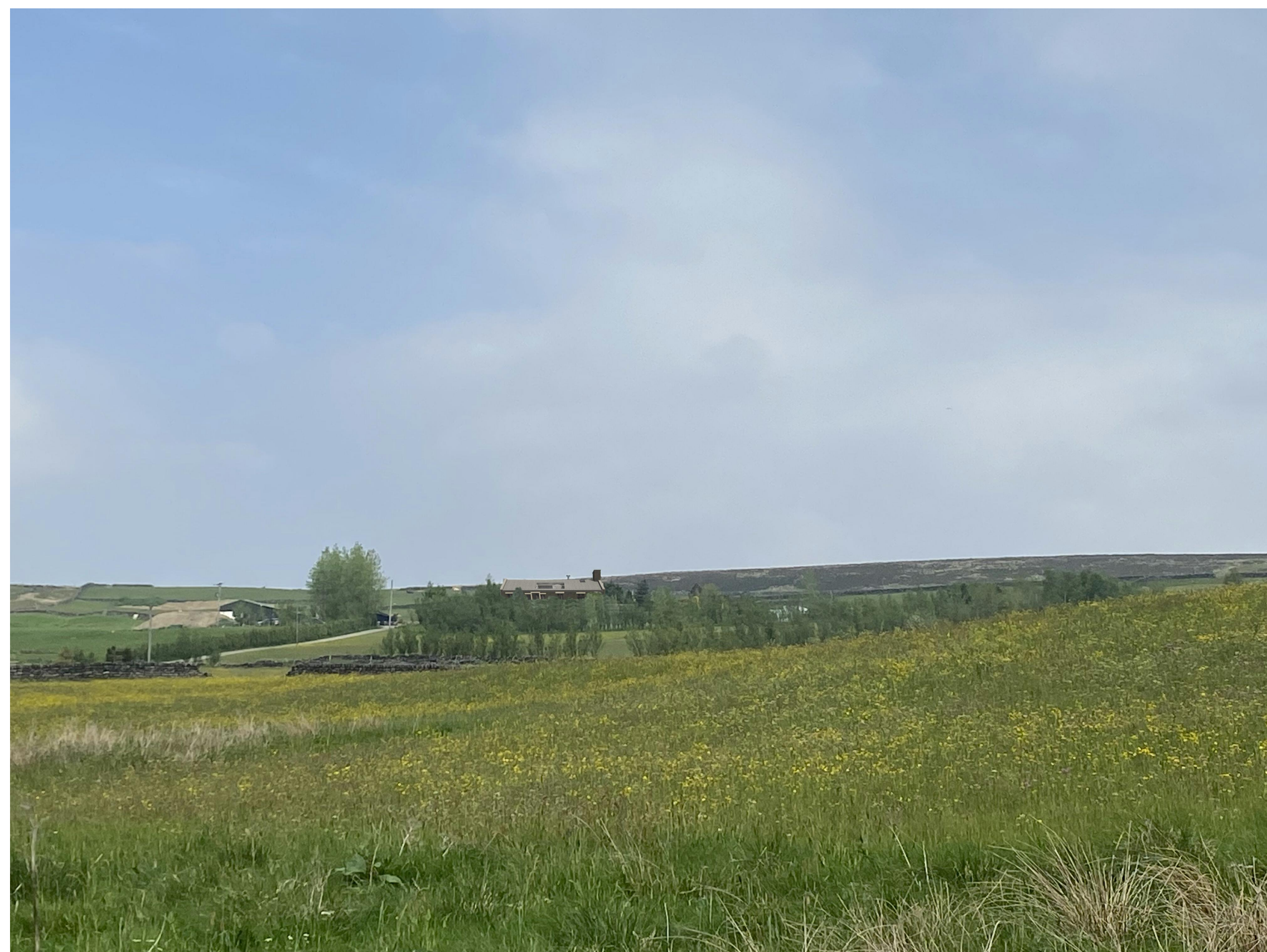
View of Keelham Farm On Popples Lane, Proposed alterations to Farm shown in imposed on Existing