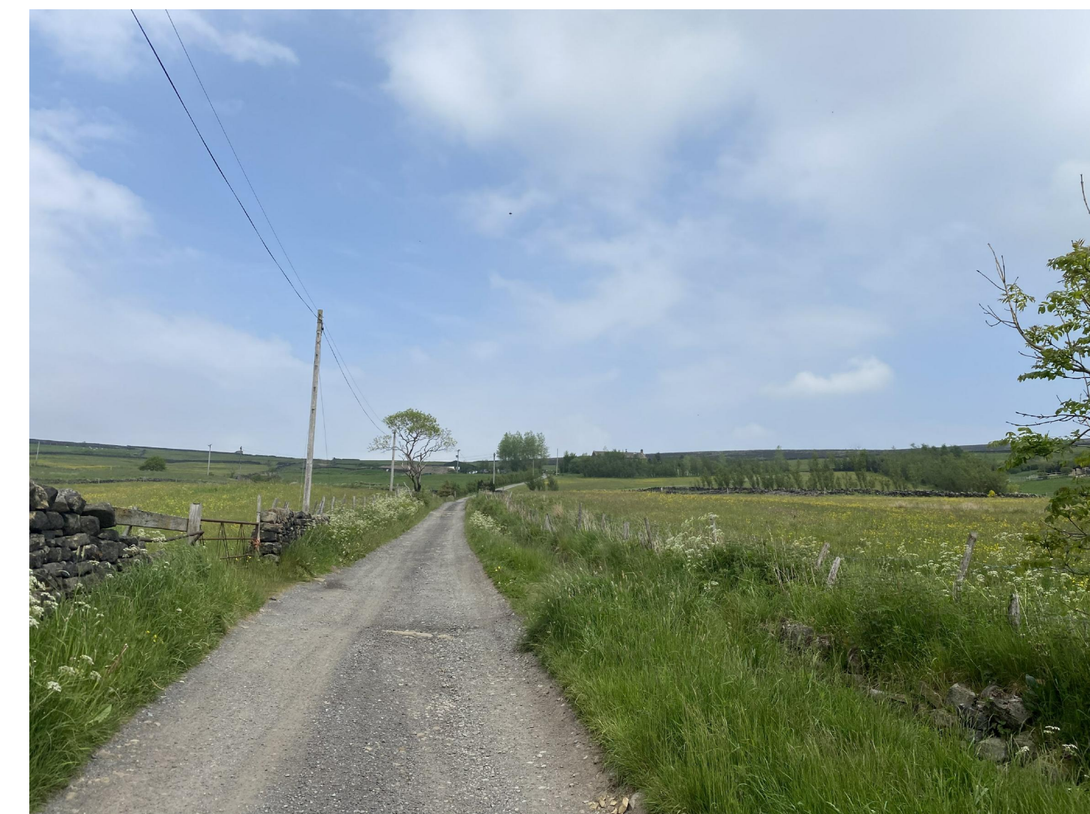
View of Keelham Farm On Approach, Proposed Alterations can not be seen