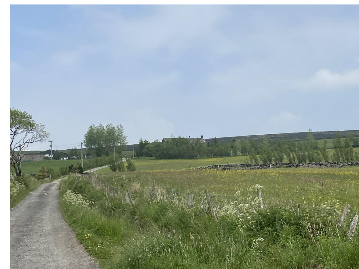
View of Keelham Farm On Approach, Proposed Alterations can not be seen