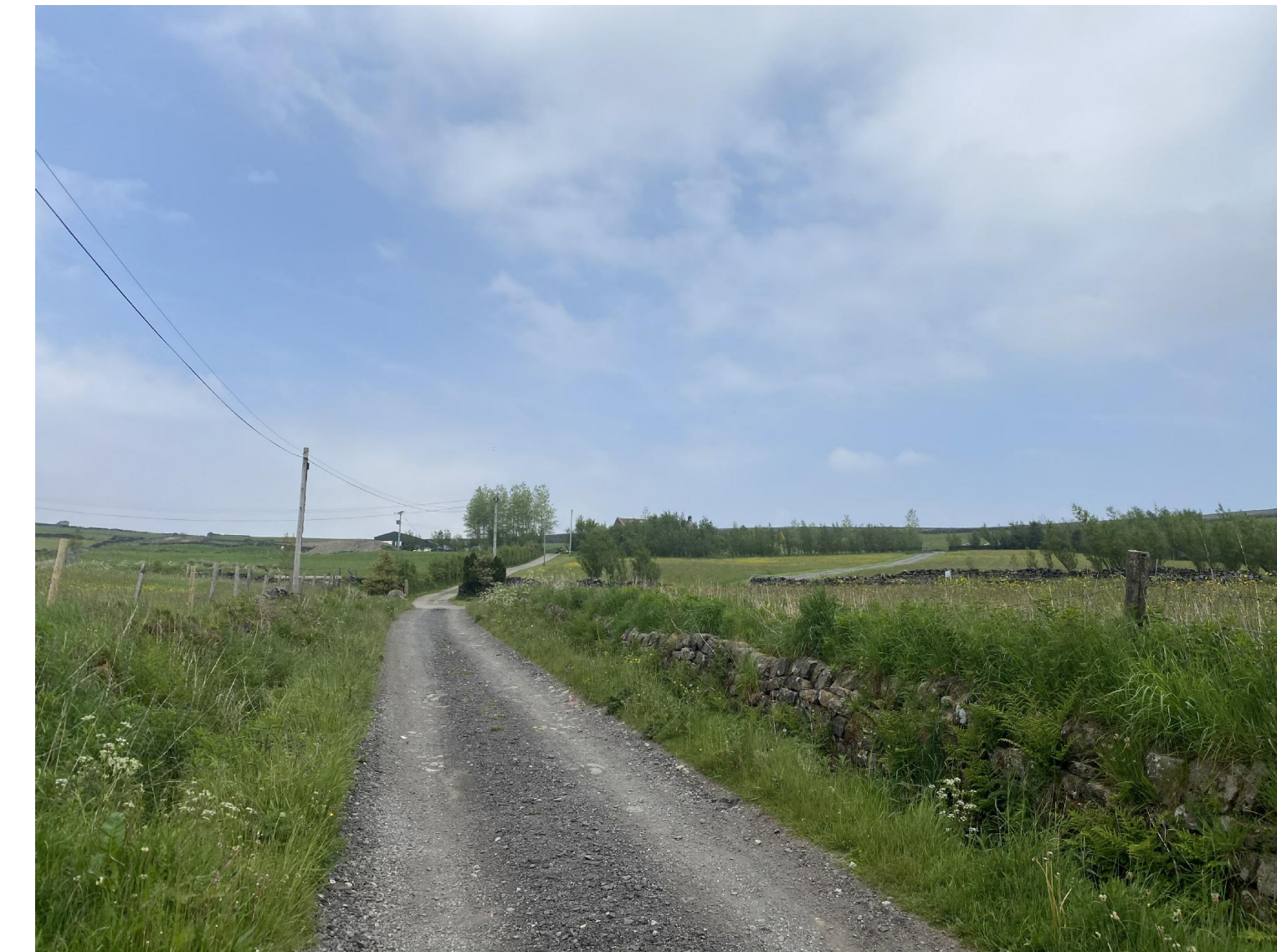
View of Keelham Farm On Approach, Proposed Alterations can not be seen