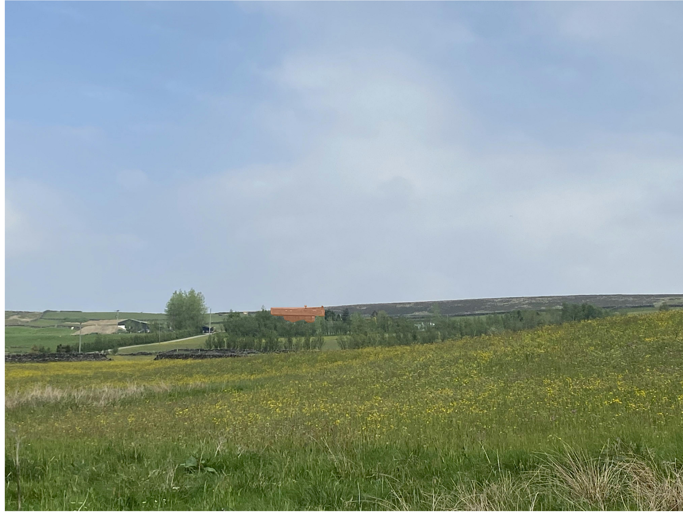
View of Keelham Farm On Popples Lane, Existing Farm shown in Orange