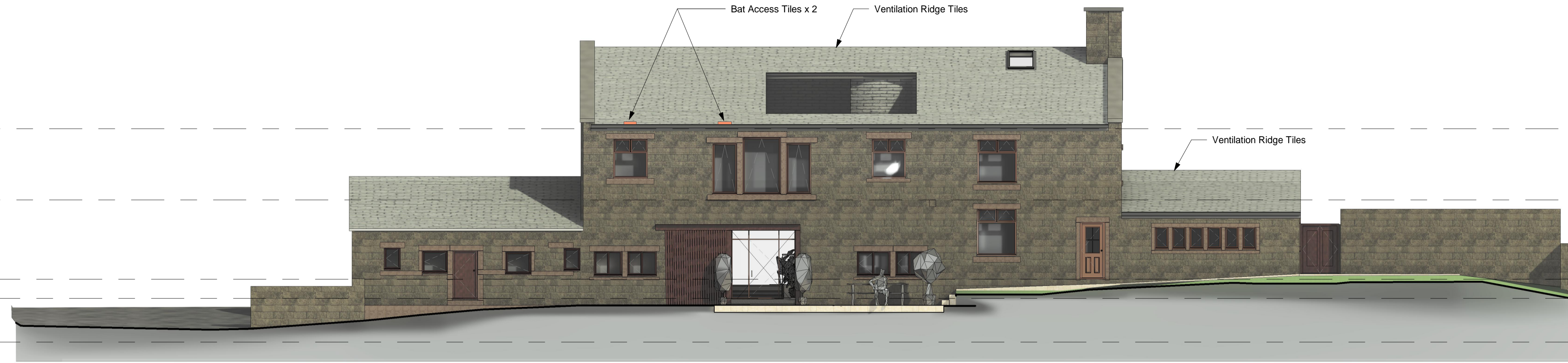
Proposed Front Elevation Scale: 1 : 100