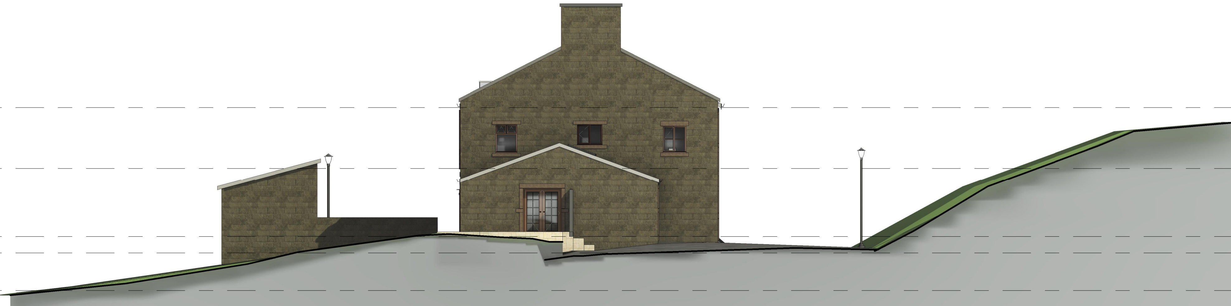
Proposed RH Side Elevation Scale: 1 : 100