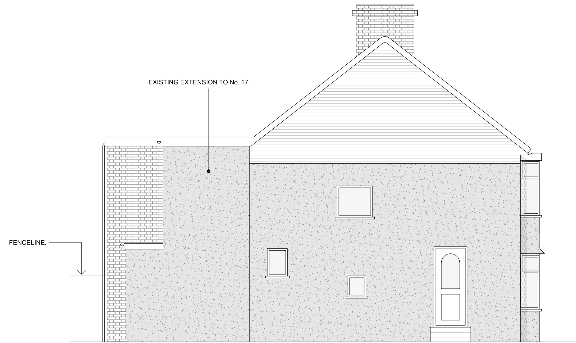
EXISTING ELEVATION D VIEW FROM No. 17 1:50 AT A1 (1:100 AT A3)