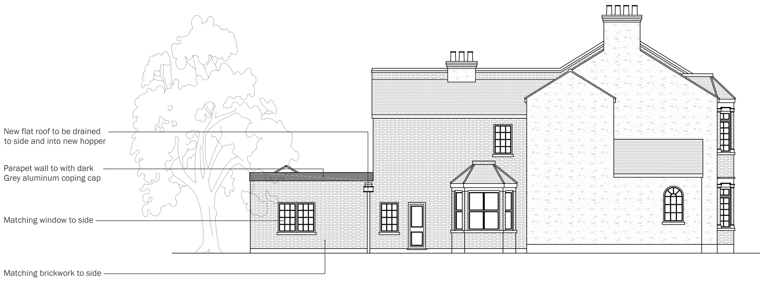
PROPOSED SIDE ELEVATION 1:100