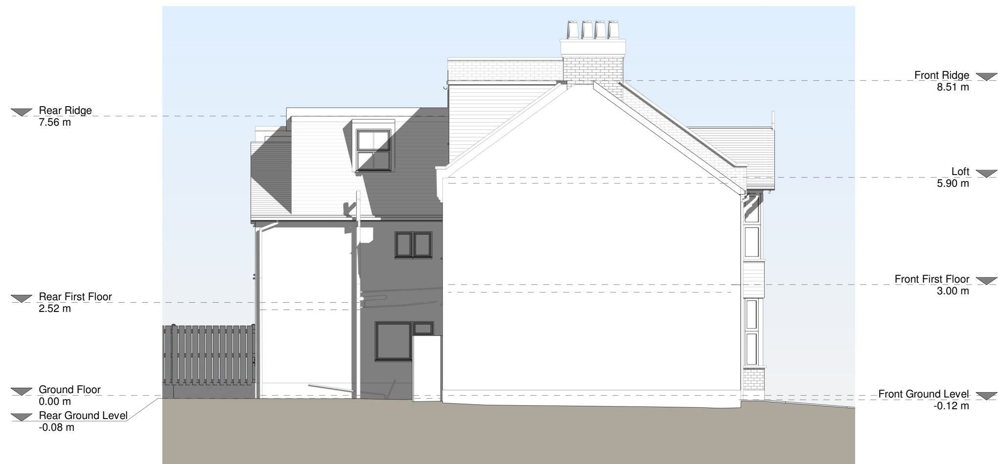
Left Side Elevation