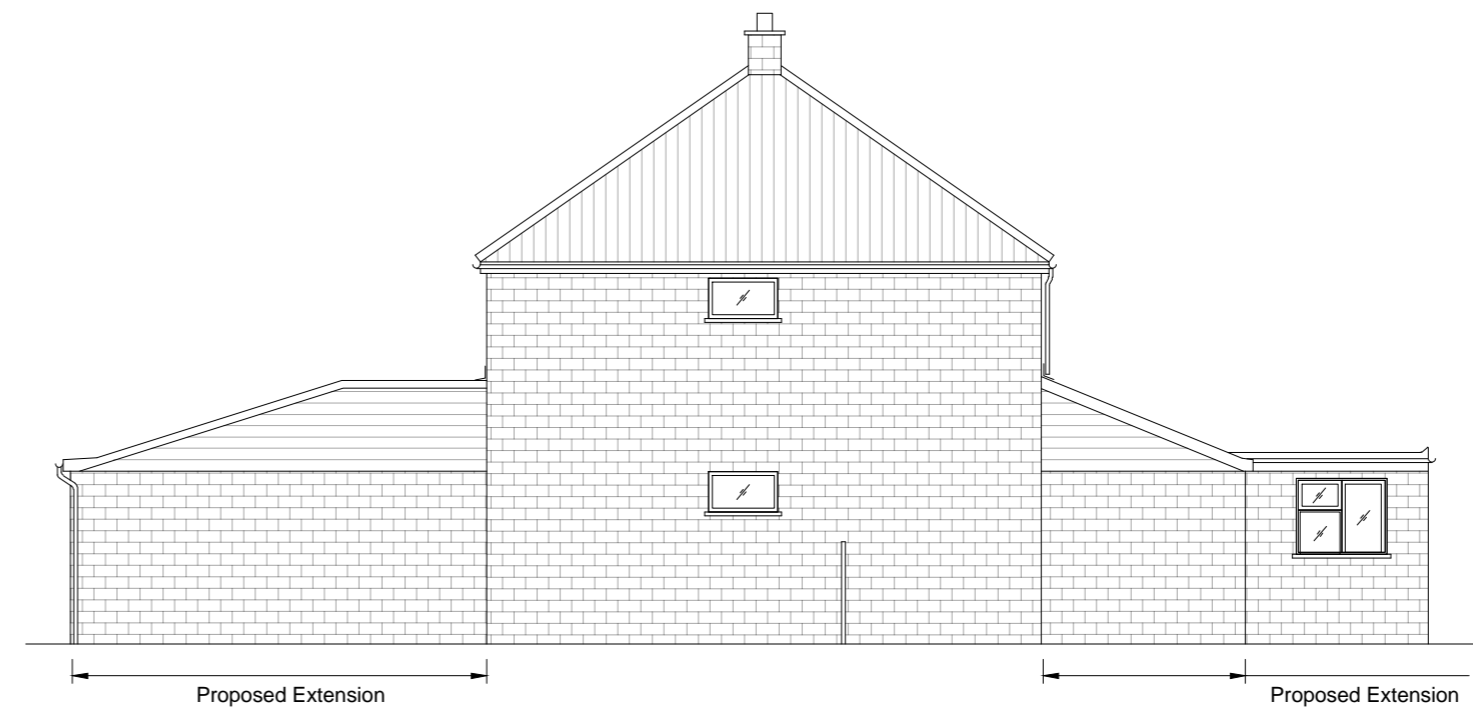
Proposed South Elevation @ 1:100