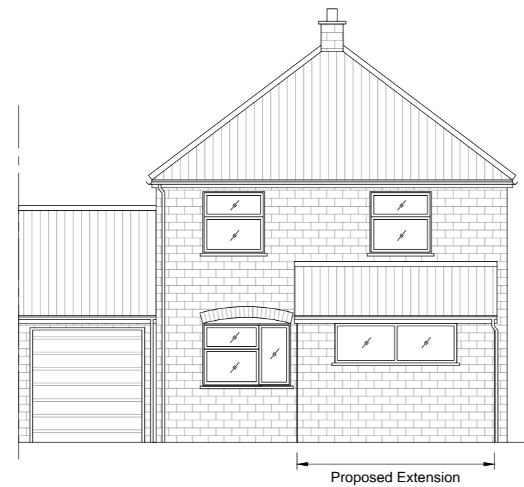
Proposed West Elevation @ 1:100