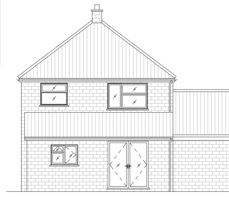
Proposed East Elevation @ 1:100