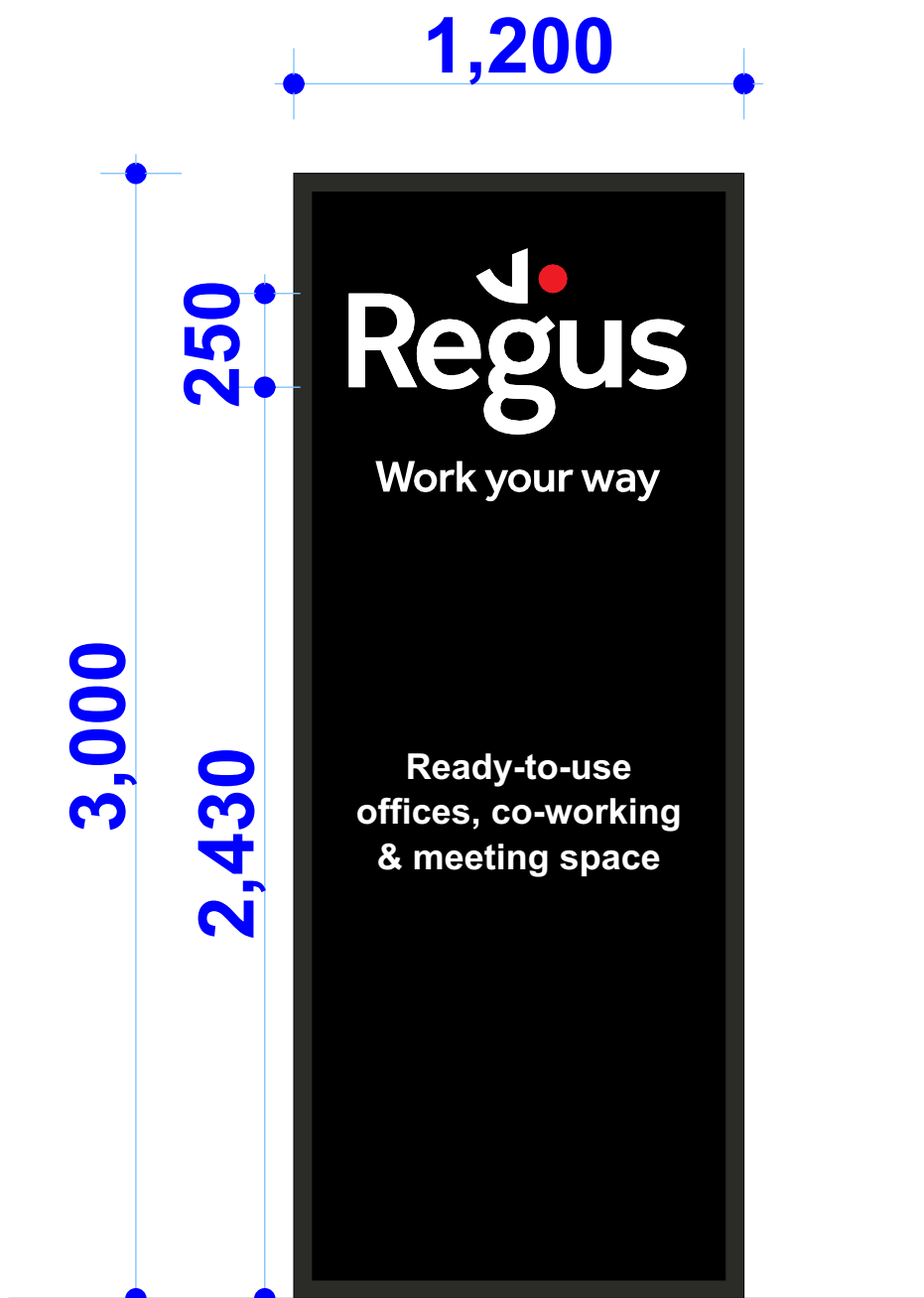
SIGN "B" - Monument Aluminium composite monolith with internal box section frame. Vinyl detail on both sides.