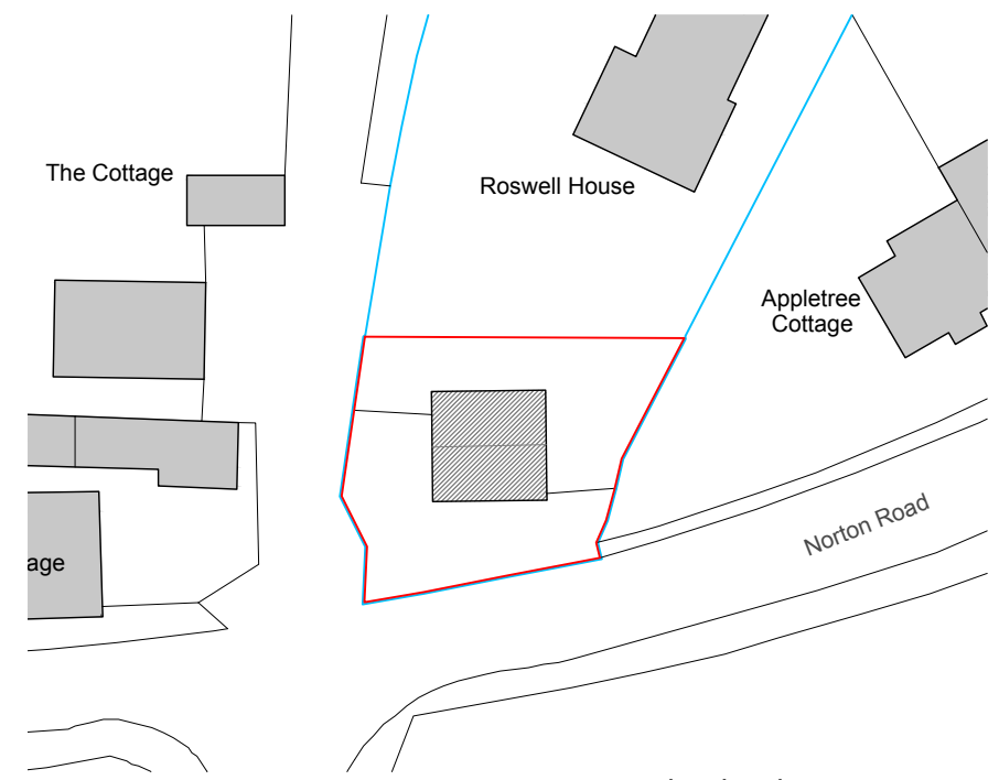
Existing Block Plan @ 1:500