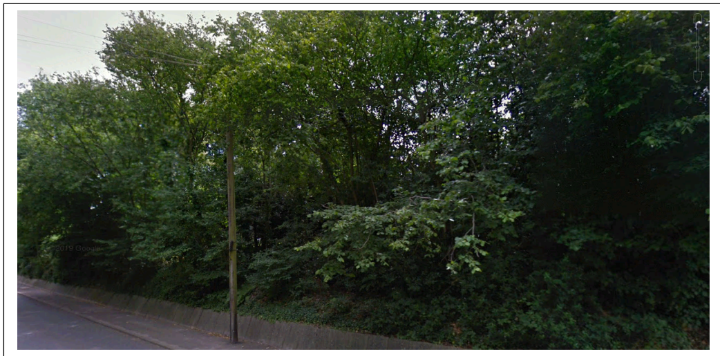
Screening of site from Winchester Road