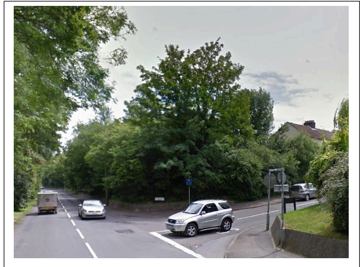
View from northwest