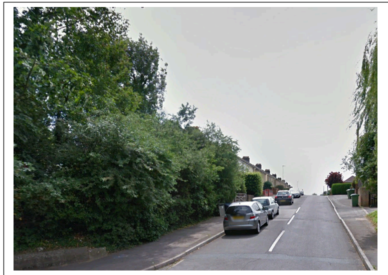
Frontage of site with established development of Princes Road rising to the south