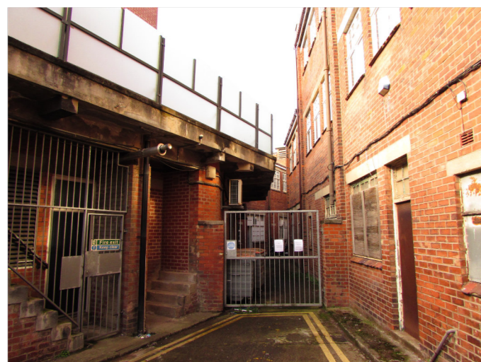
A - GATE TO REFUSE AREA AND GATED STAIRWELL