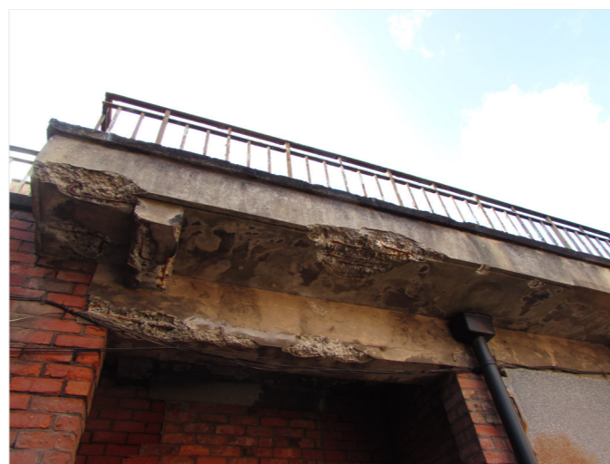
D - FAILING CONCRETE OF BALCONY AREA TO REAR OF CHURCH STREET.