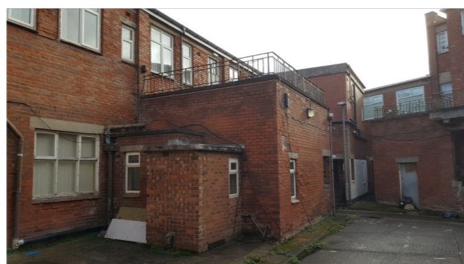
H - SINGLE STOREY OUTBUILDING TO REAR OF COOKSON STREET.