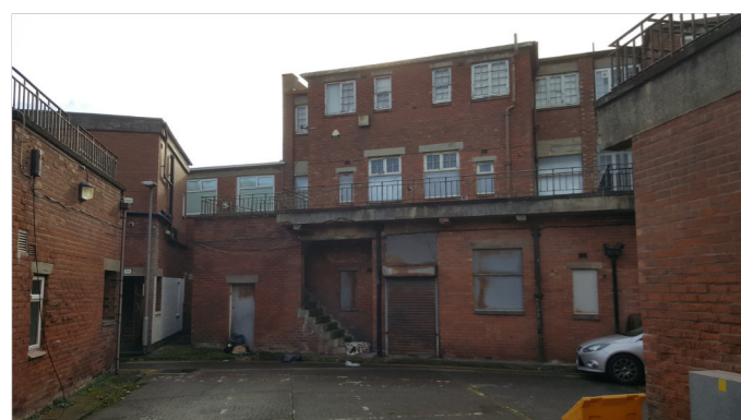
F - REAR CORNER OF COOKSON AND CHURCH STREET.