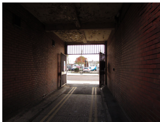
C - ACCESS GATES OFF COOKSON STREET.