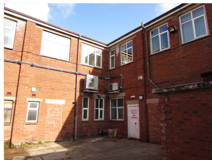
B - REAR CORNER OF CAUNCE AND COOKSON ST.