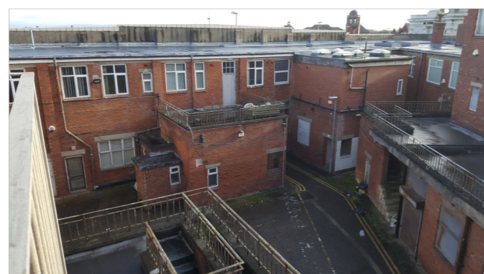
G - VIEW TOWARD REAR COOKSON STREET ELEVATION FROM SECOND FLOOR ESCAPE STAIR.