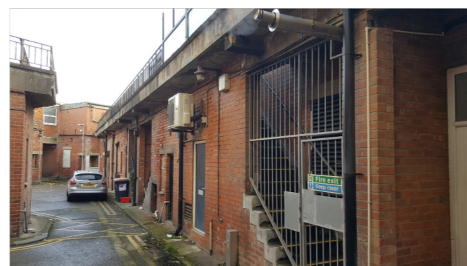
J - LOOKING ALONG THE REAR OF CHURCH STREET TOWARDS COOKSON STREET.