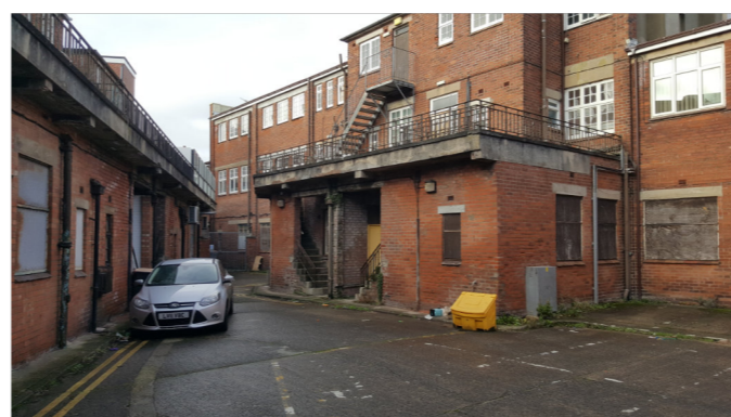
I - SINGLE STOREY OUTBUILDING TO REAR OF CAUNCE STREET.