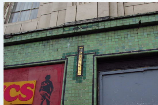
MOSAIC DETAIL: GOLD TILES, CAUNCE ST.