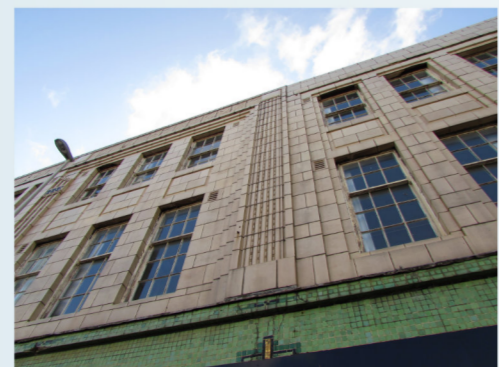
MOSAIC TO FAIENCE: CAUNCE ST.