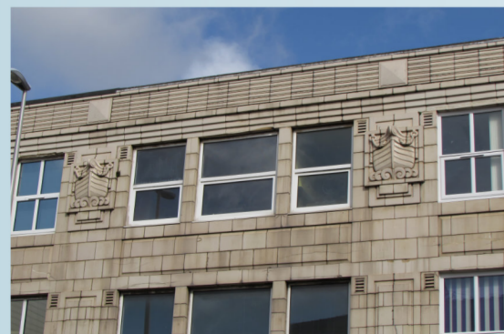
FAIENCE DETAILING: VIKING SHIPS, CHURCH ST.