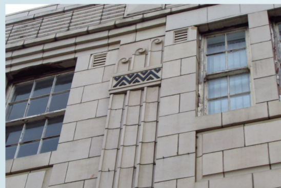
FAIENCE DETAILING: CAUNCE ST.