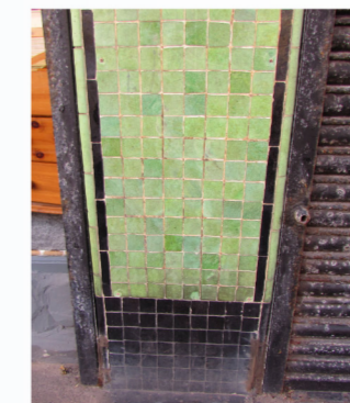
MOSAIC PLINTH DETAIL: CAUNCE ST.