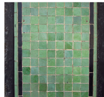
MOSAIC COLUMN DETAIL: CLOSE UP