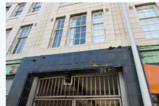
COURTYARD ACCESS: BLACK TILE, CAUNCE ST.