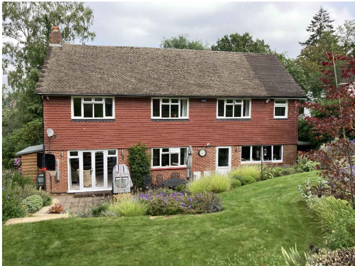
86 OAKHILL ROAD - REAR ELEVATION