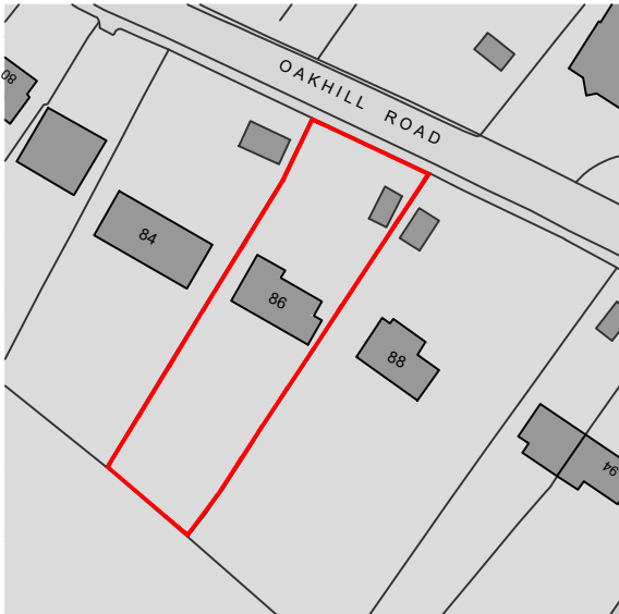
SITE LOCATION PLAN SCALE 1:1250 @ A4