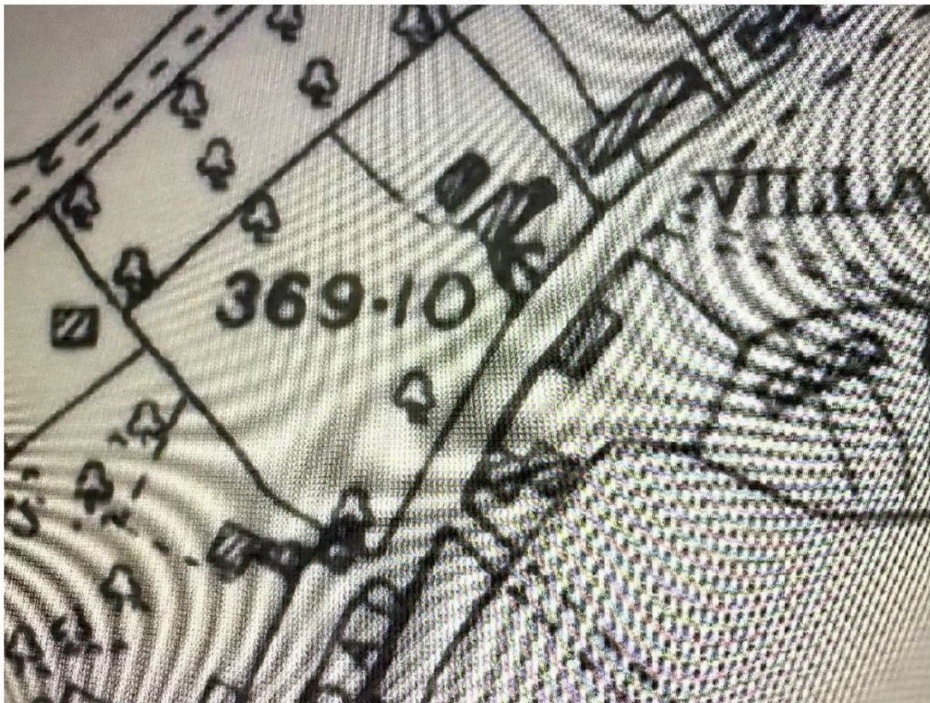
Extract of OS 1938