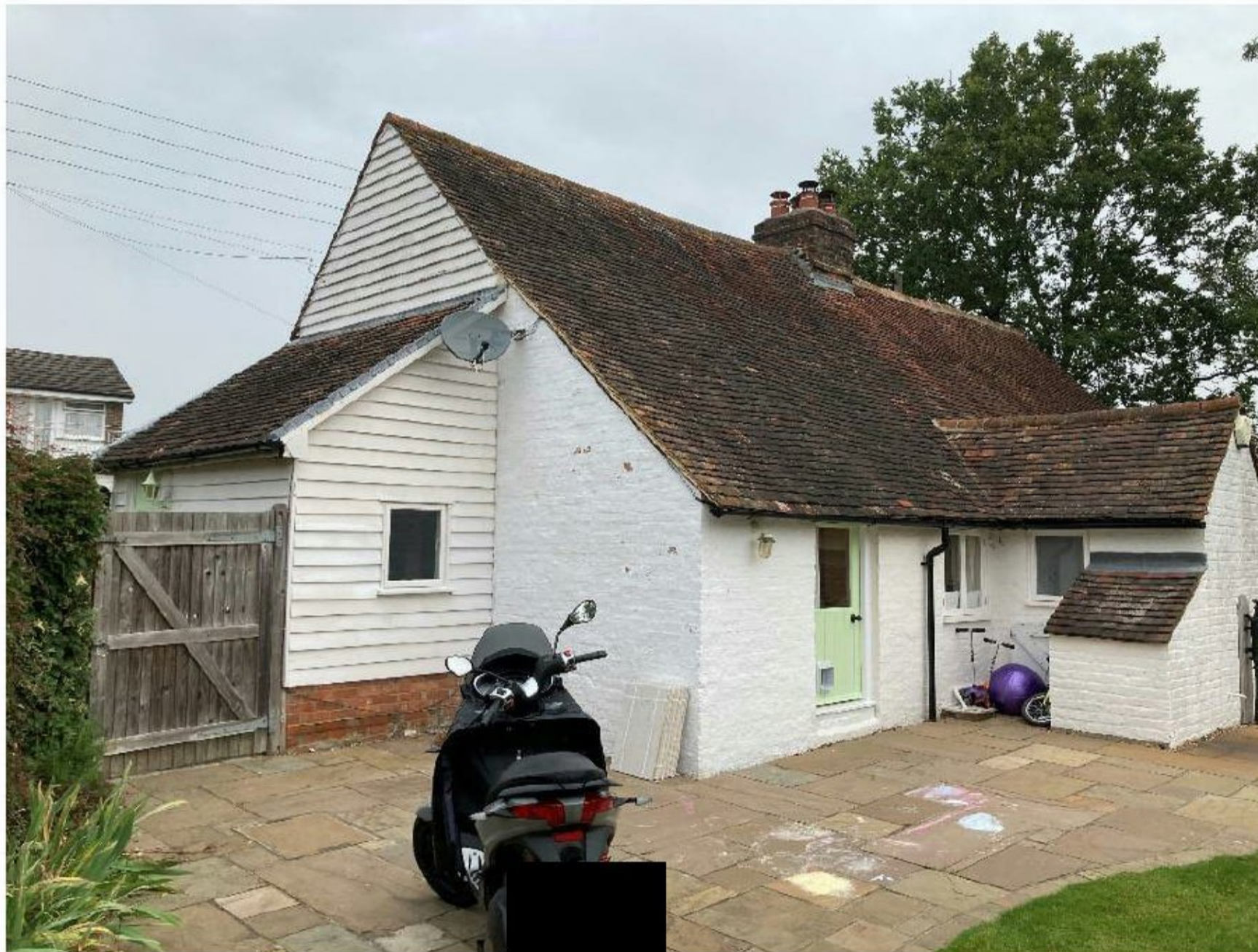
Photo of south end wall

It is considered that there is no 'harm' either to historic fabric nor setting with these proposals.