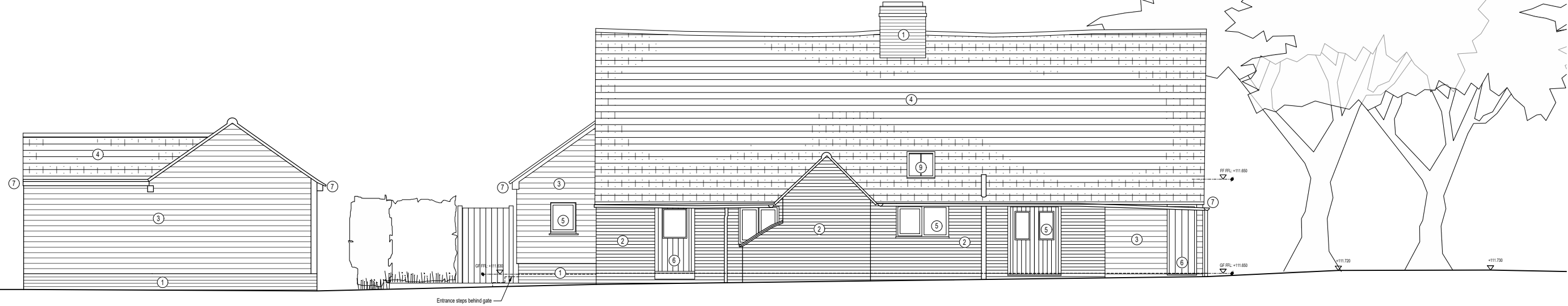
2 ELEVATION Existing Eastern Rear Elevation