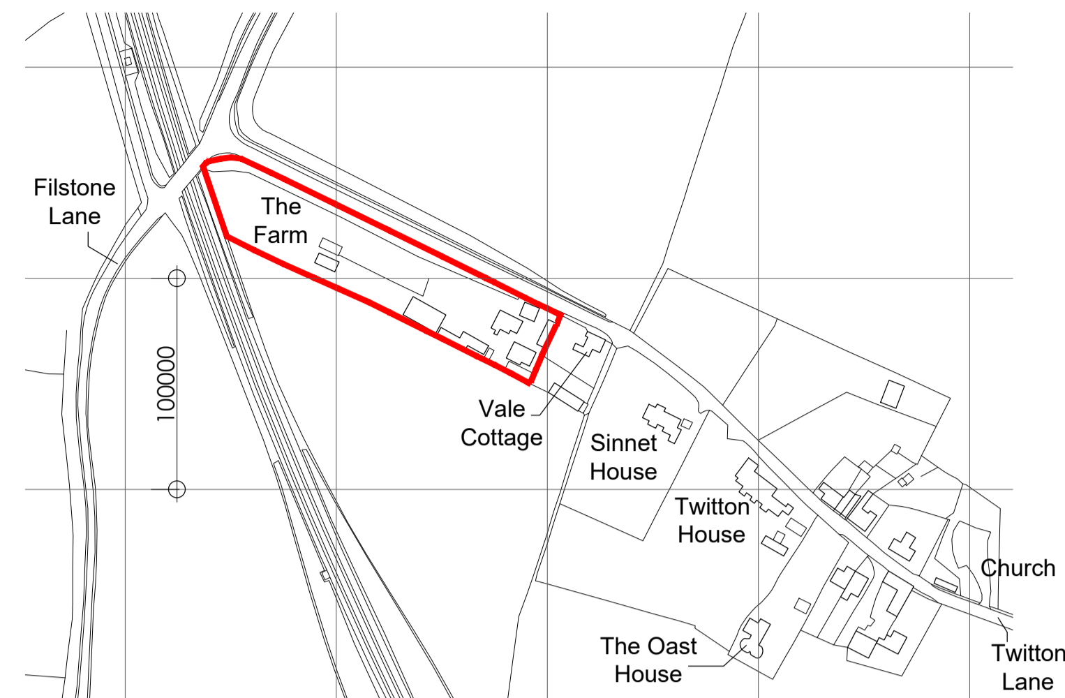
Site Location Plan Scale 1:2500