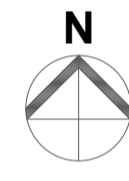
Proposed Site Layout Plan Scale 1:200