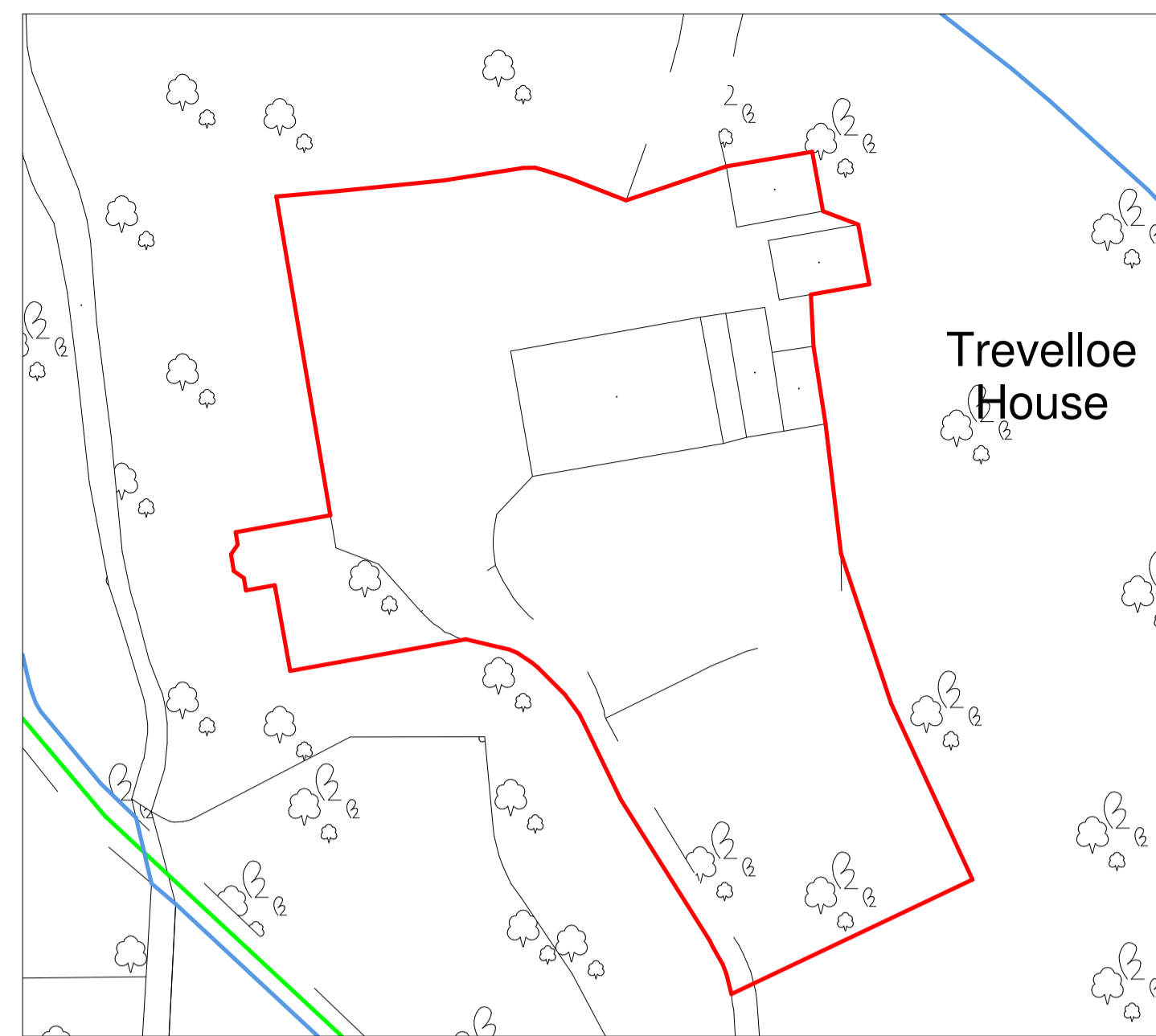
2 Existing Block Plan 1 : 500