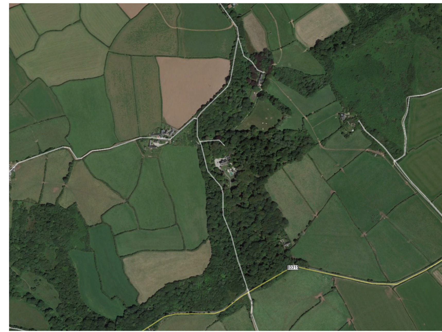
Google Earth Image