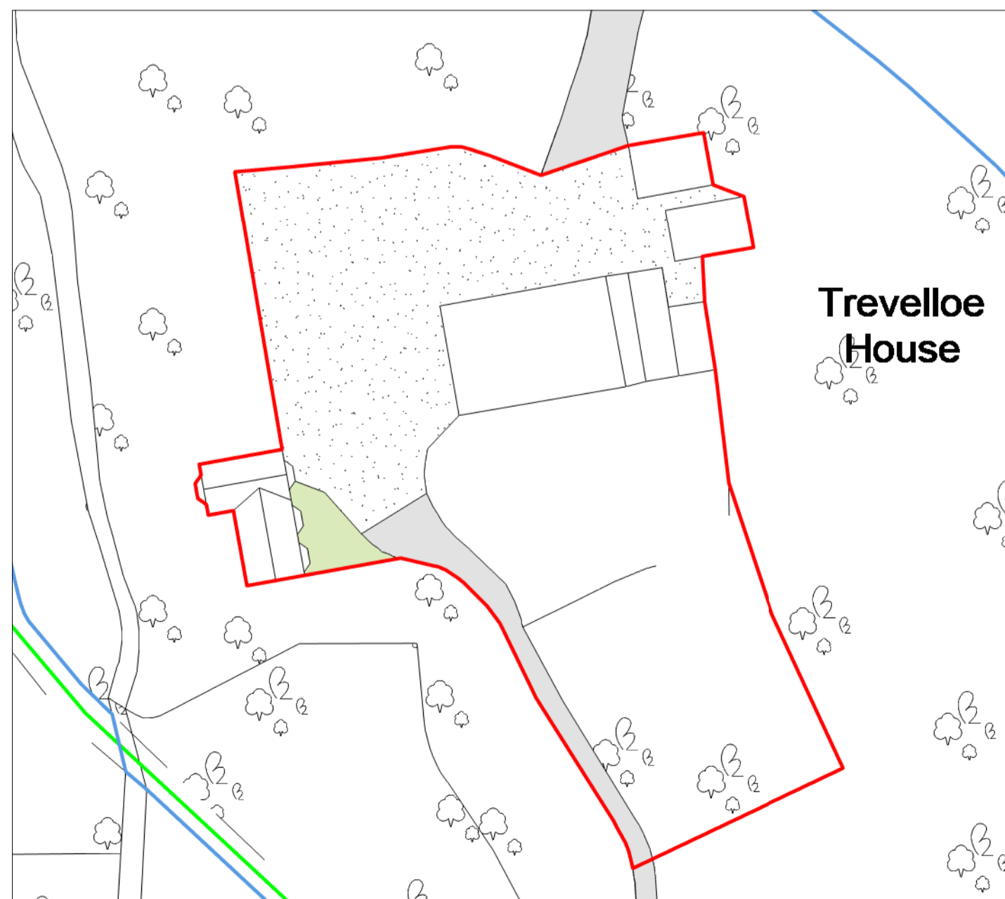
4 Proposed Block Plan 1 : 500