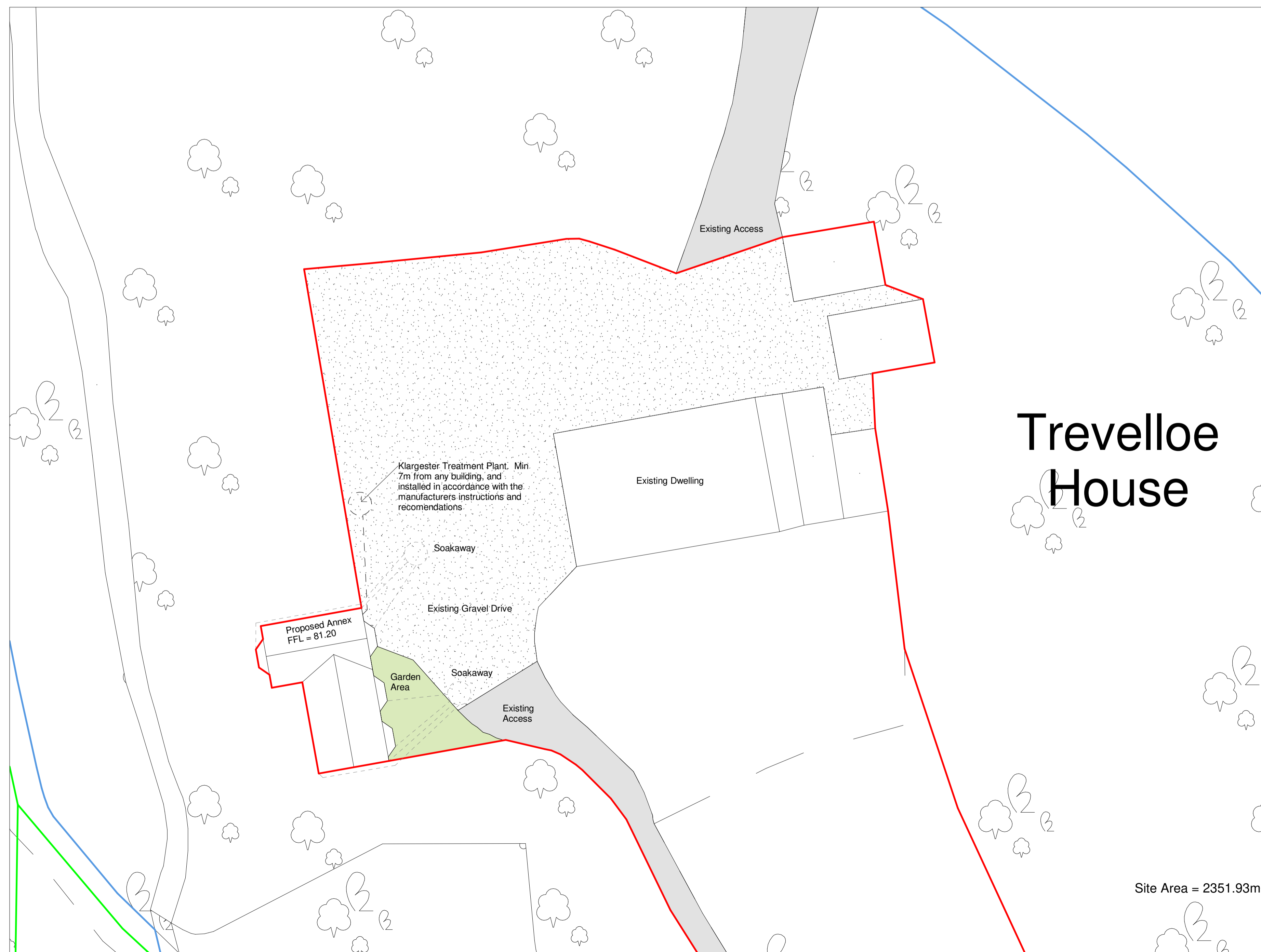
5 Proposed Site Plan 1 : 200