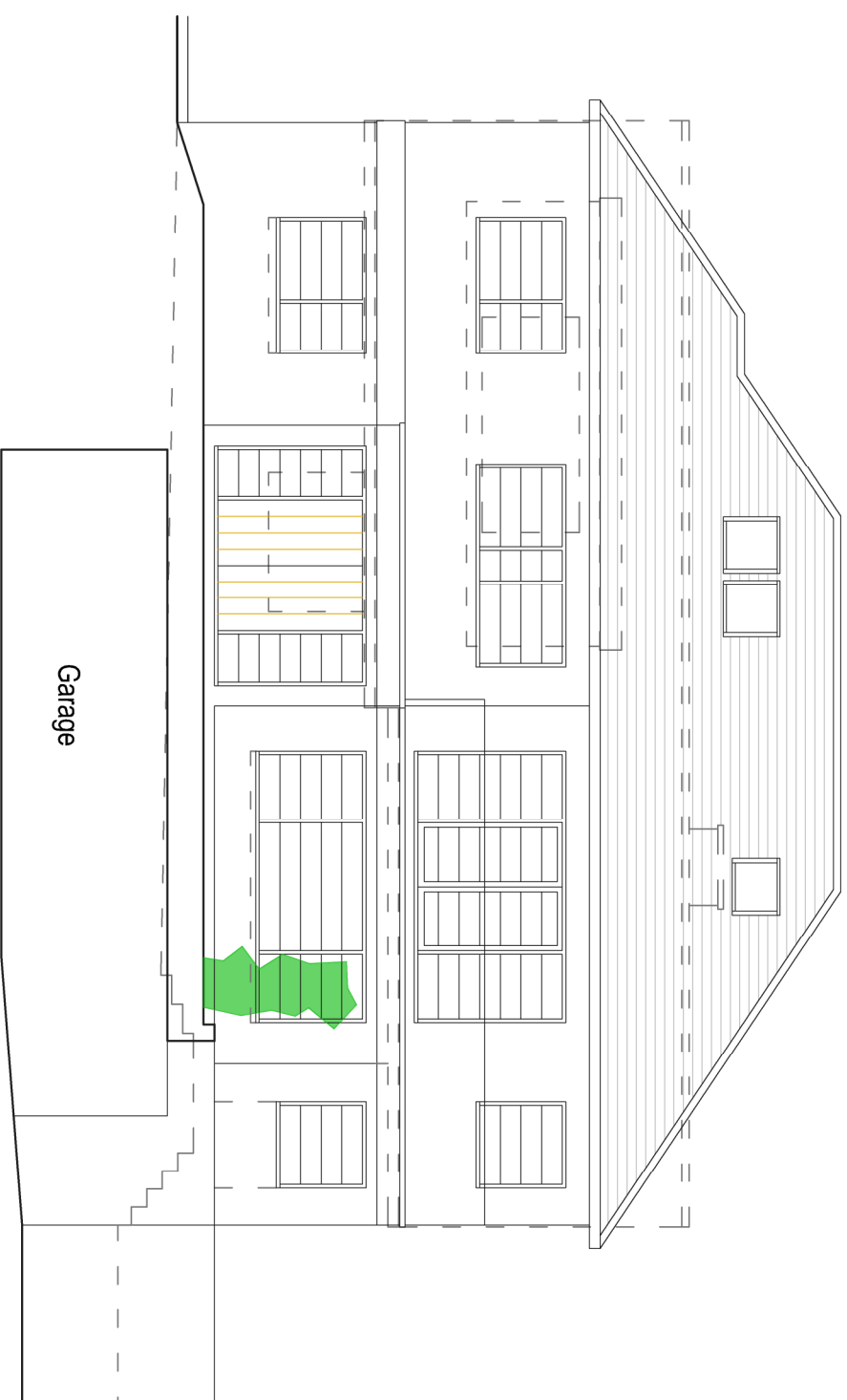
Front Elevation (South West) @ 1:100