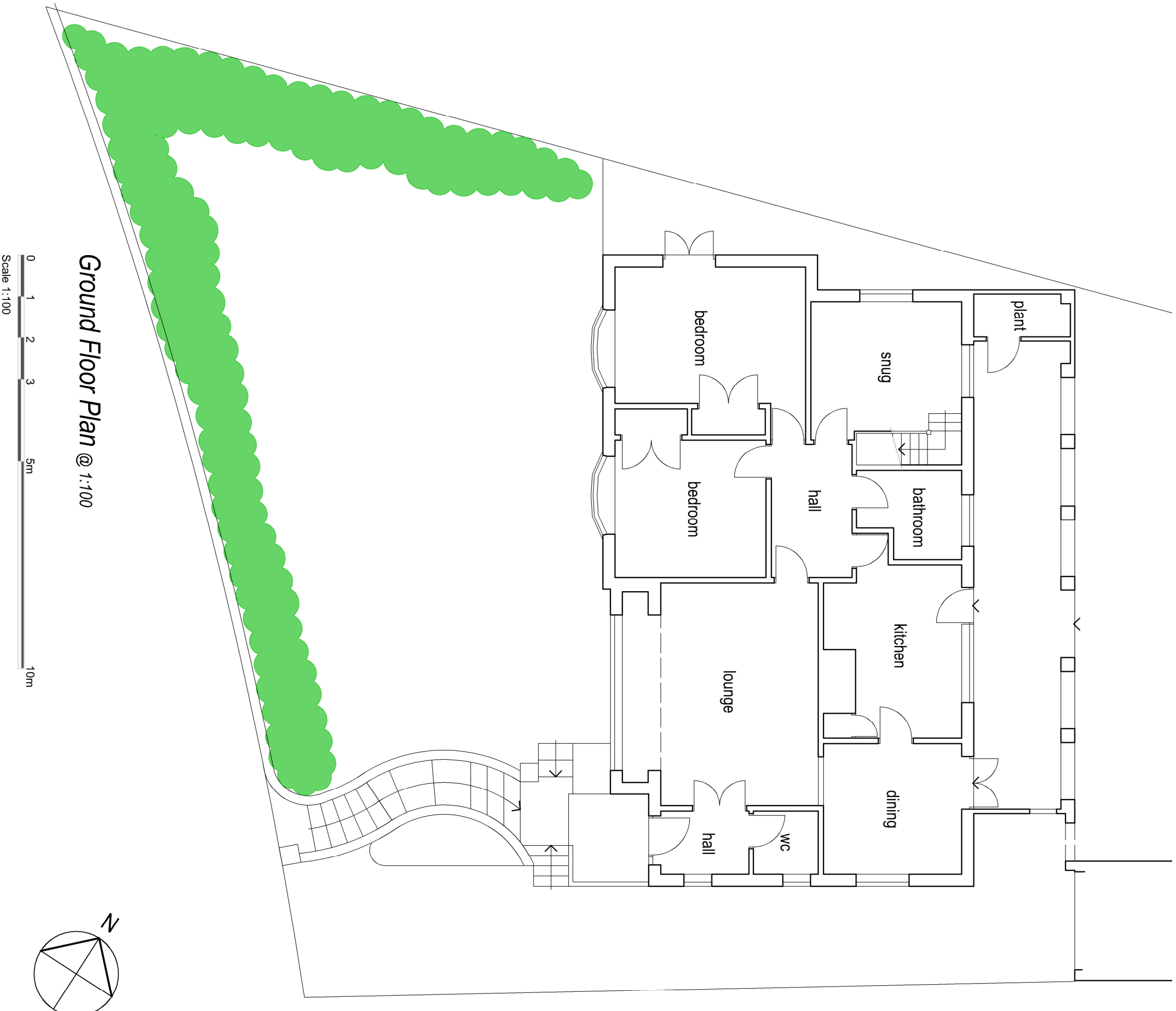
Ground Floor Plan @ 1:100