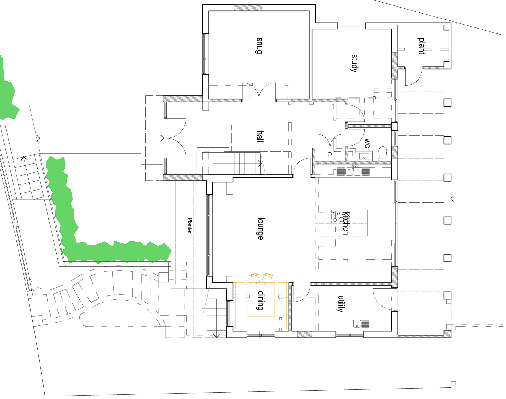
Ground Floor Plan @ 1:100