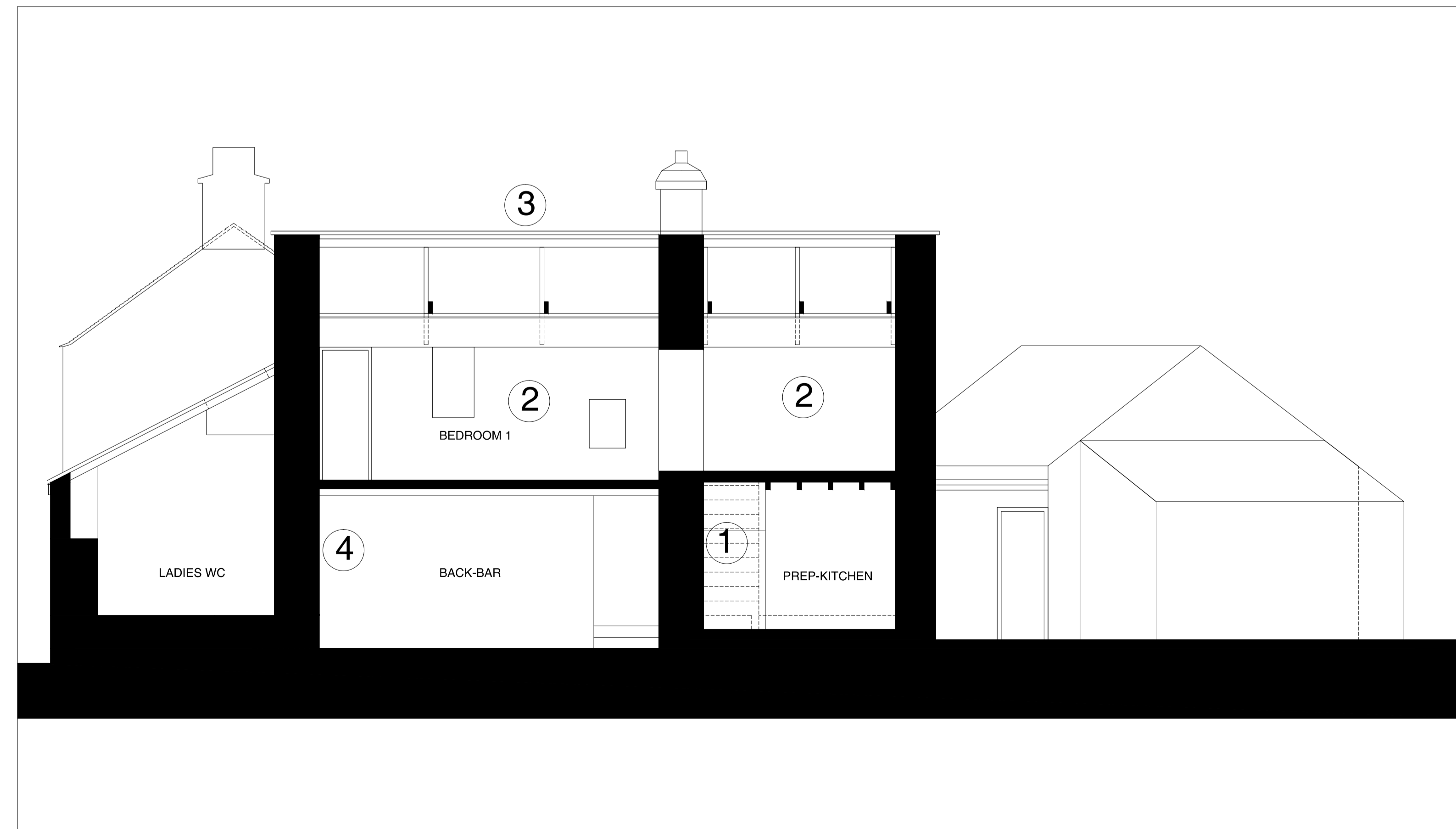
SECTION 4-4: THROUGH LADIES WC 1:50@A1