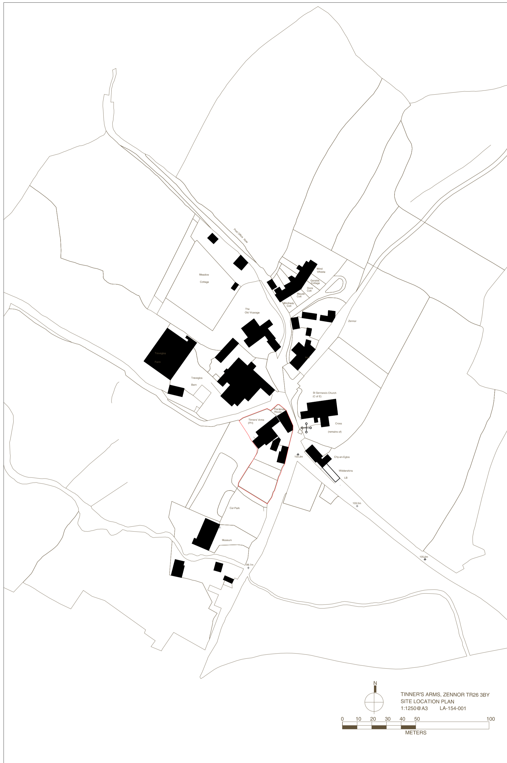
PLAN 1: OS PLAN 1:1250