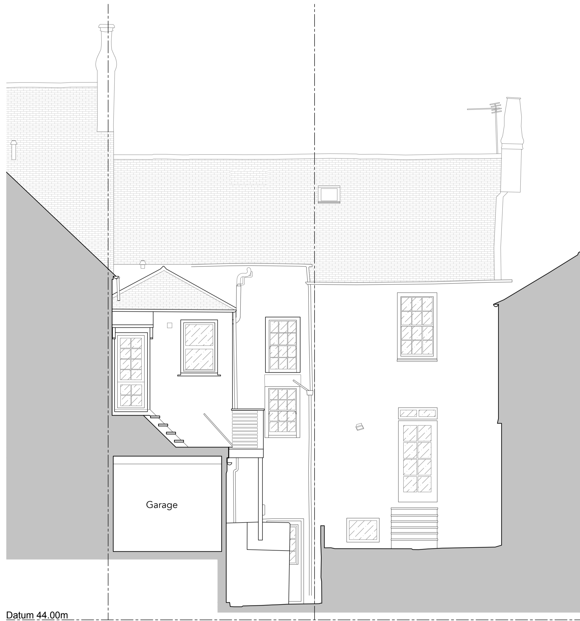
EXISTING SECTION 1 Scale 1:50 @ A1