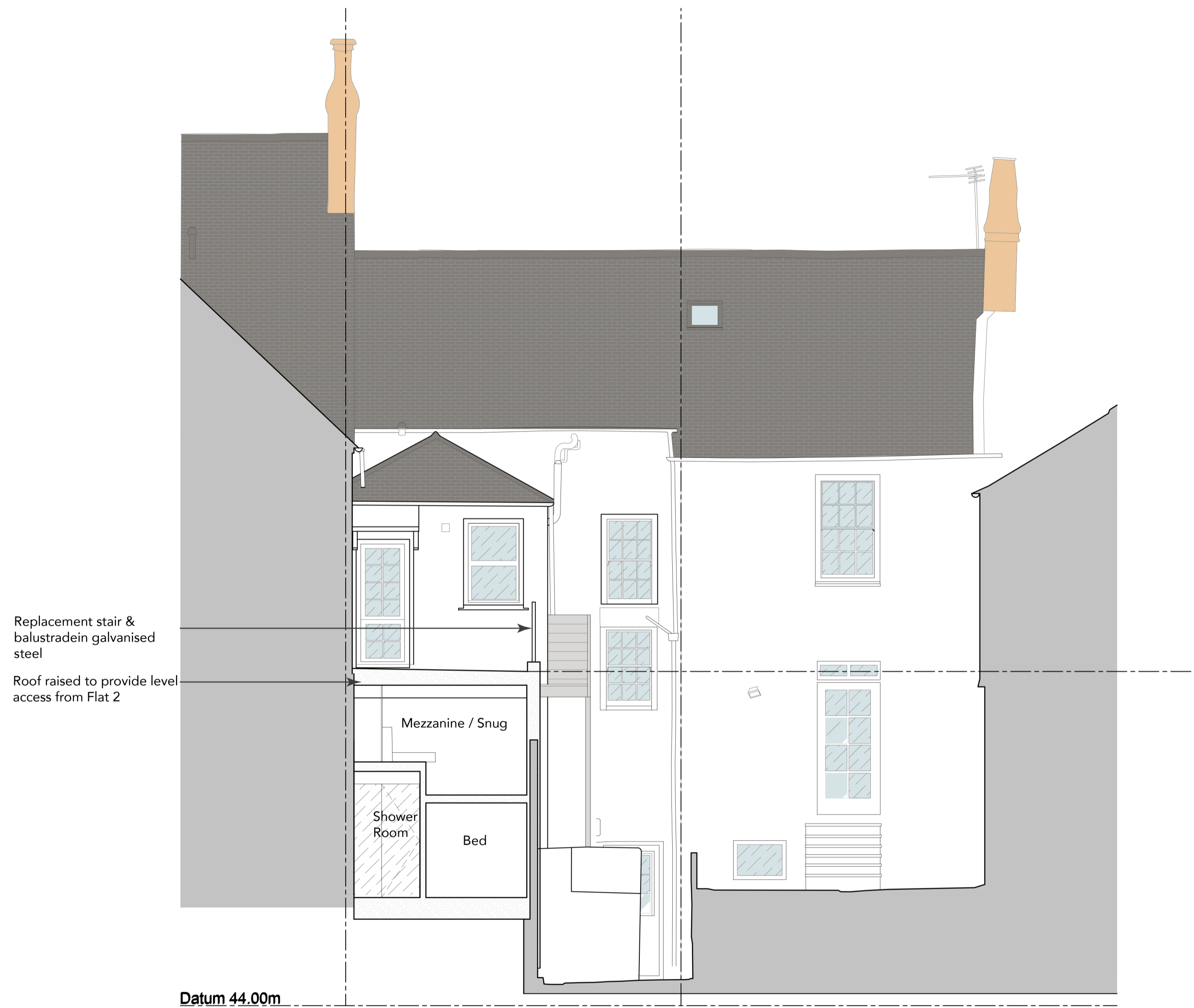
PROPOSED SECTION 1 Scale 1:50 @ A1