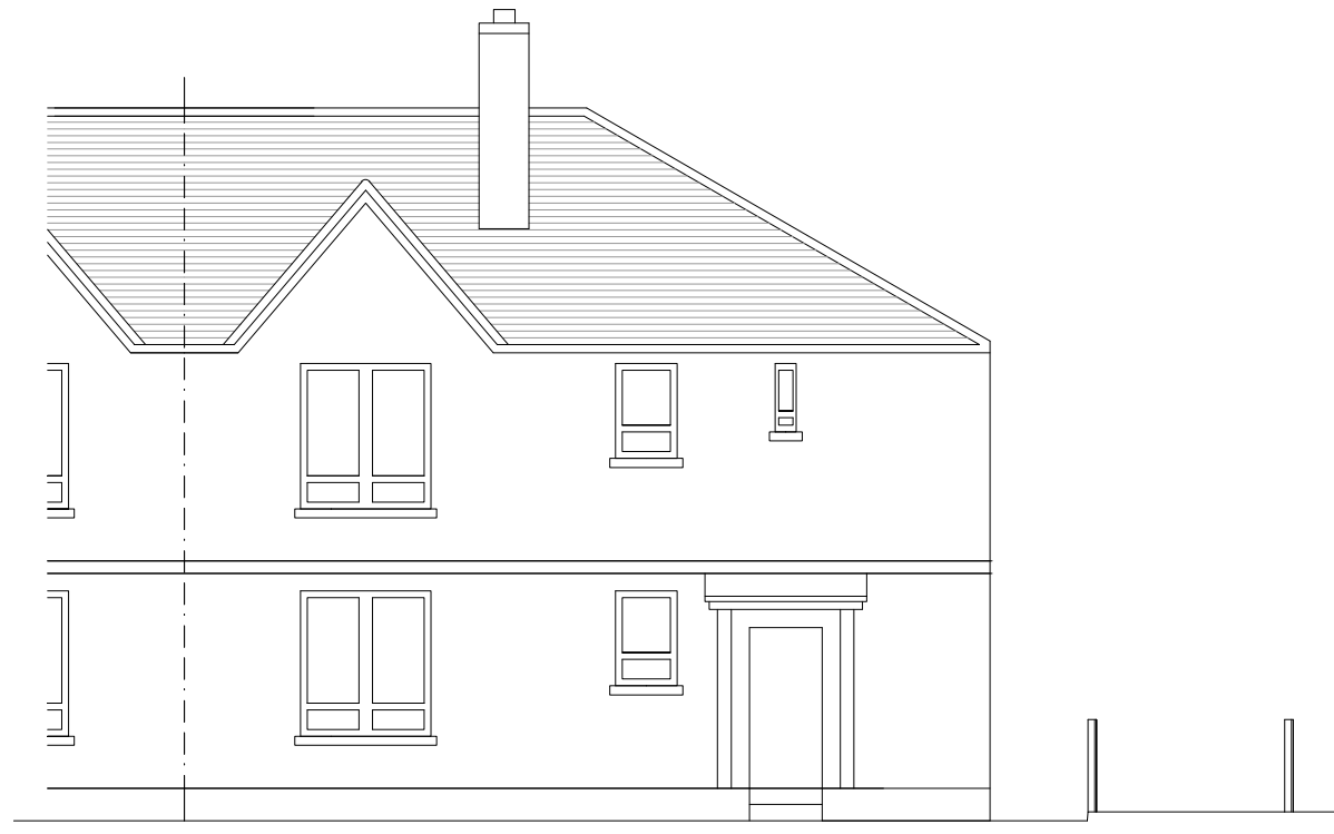
EXISTING NORTH WEST ELEVATION