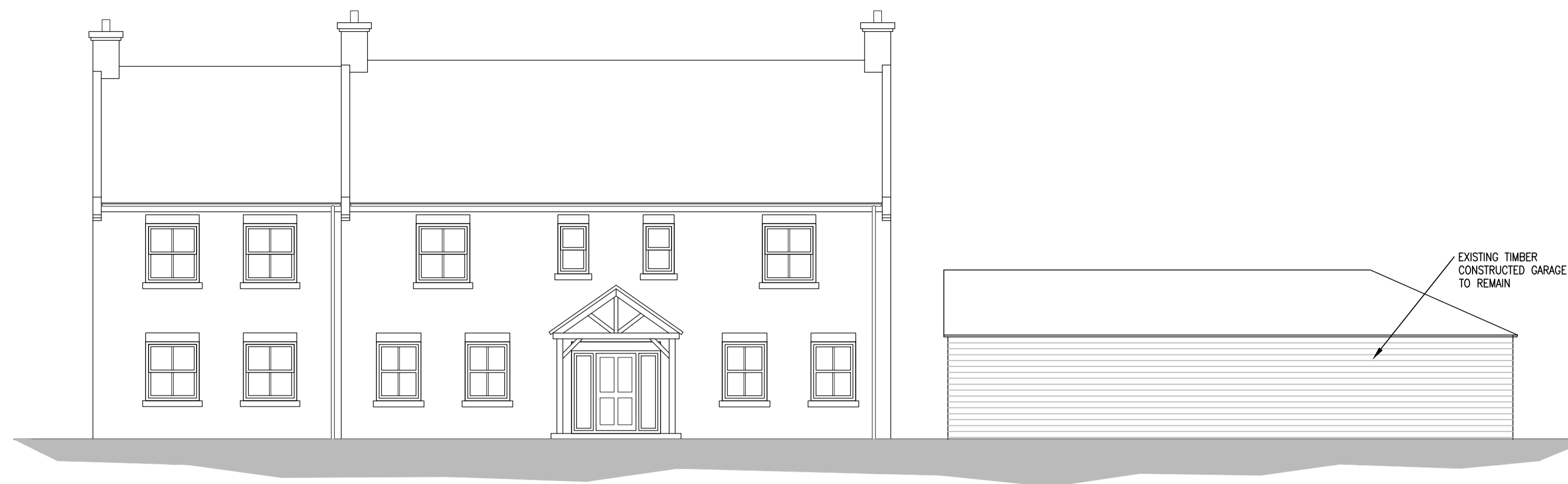
EAST FACING ELEVATION (1:100)