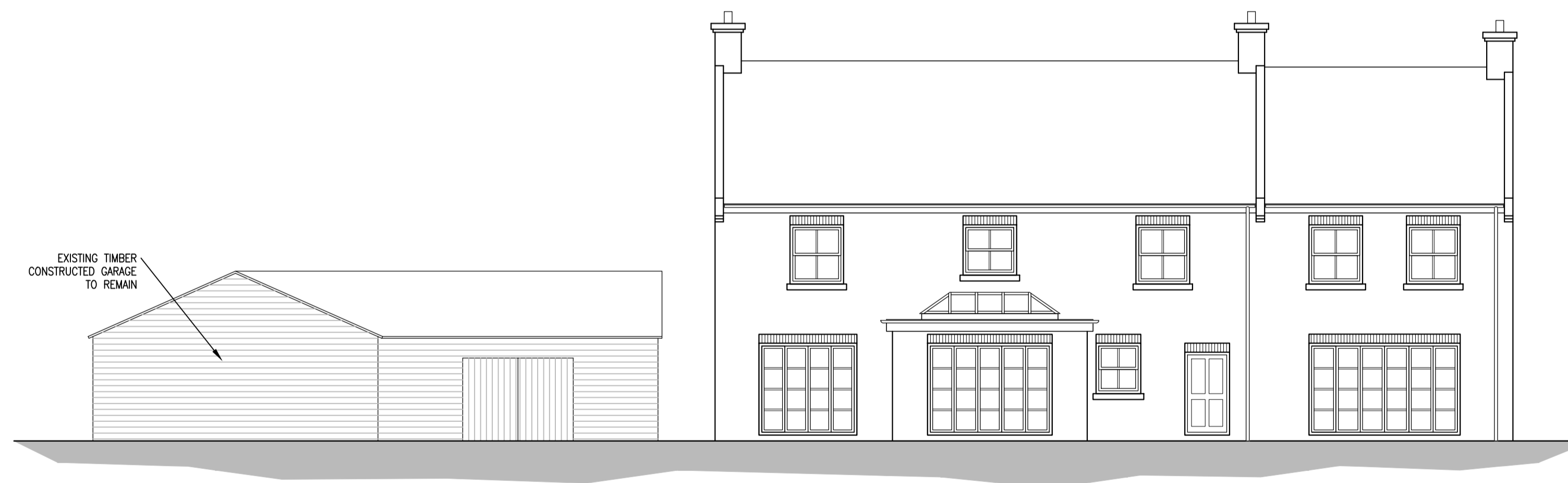
WEST FACING ELEVATION (1:100)