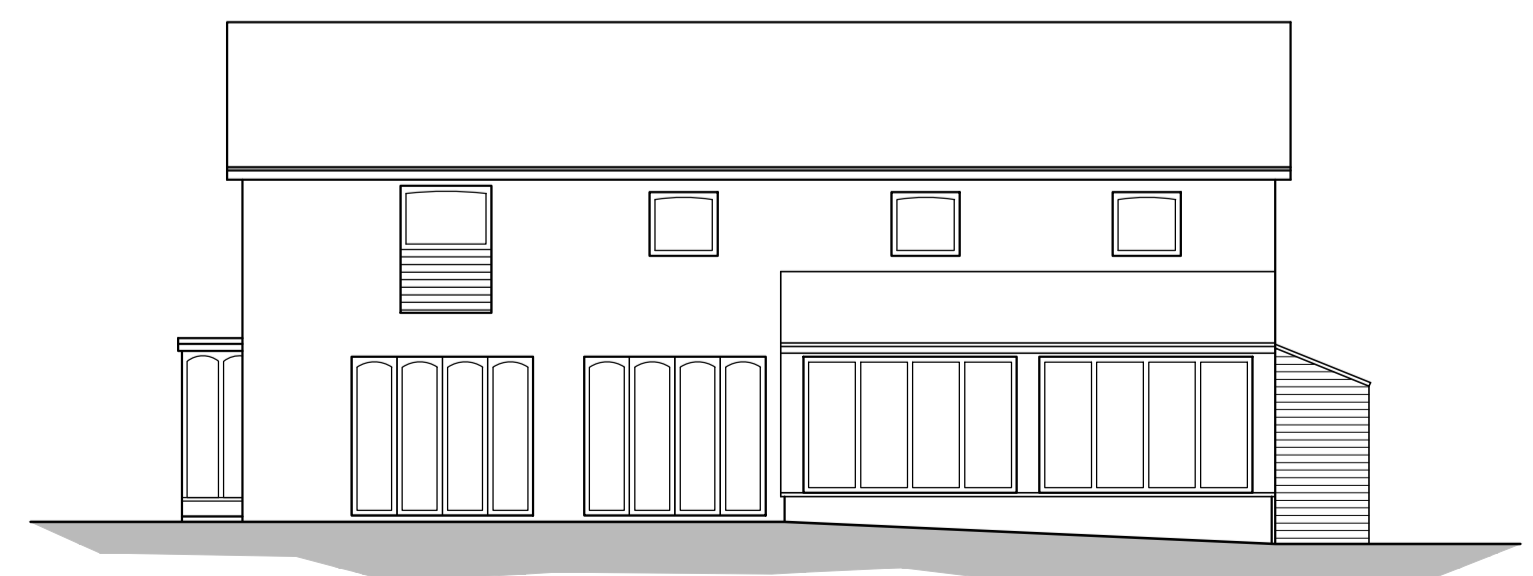
EXISTING LEFT HAND ELEVATION (1:100)