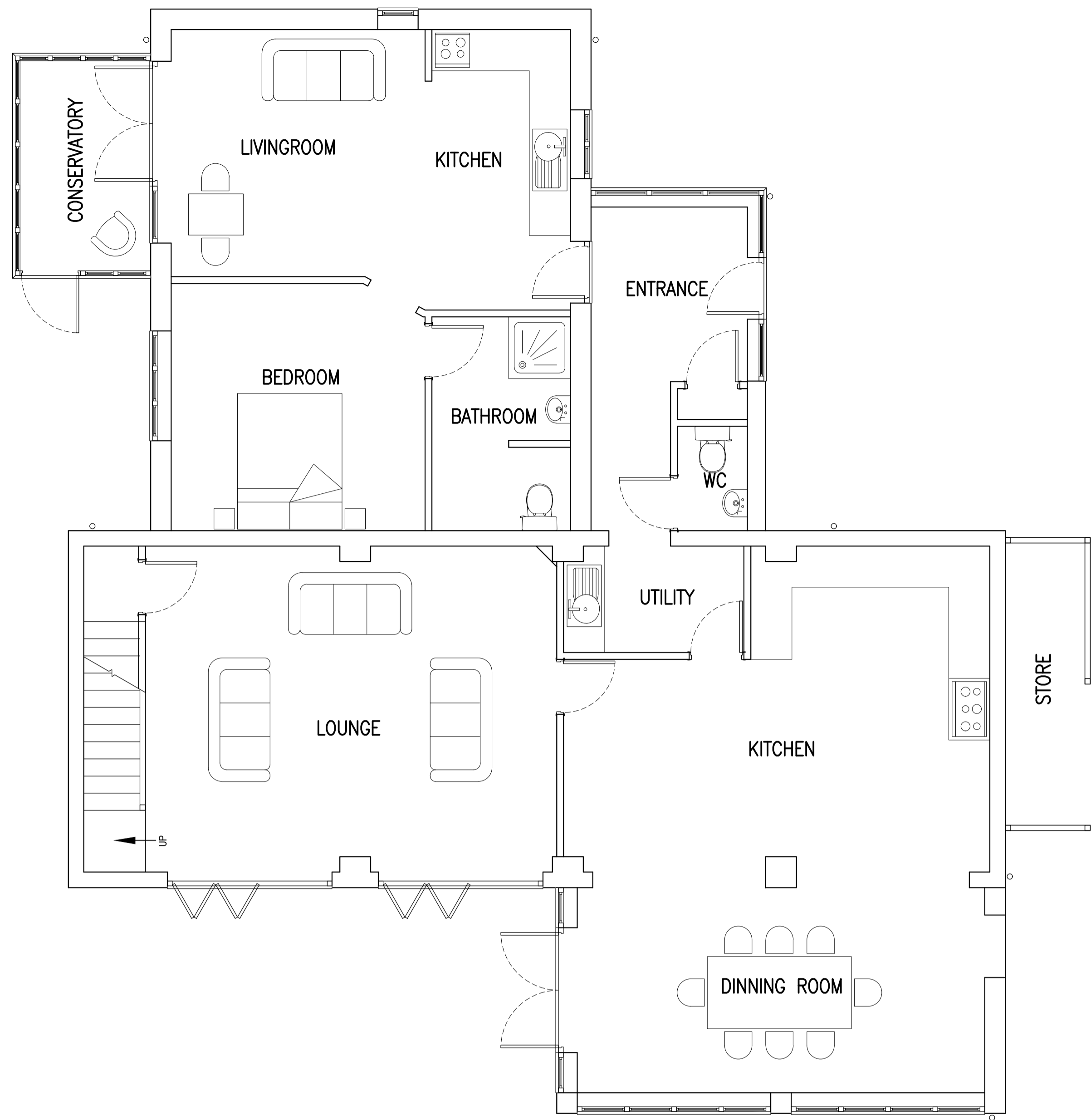
GROUND FLOOR GENERAL ARRANGEMENT (1:50)