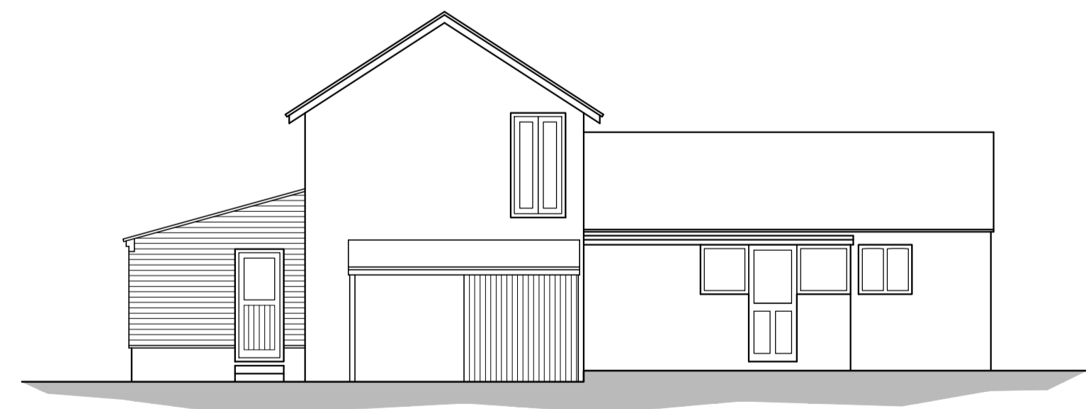
EXISTING FRONT ELEVATION (1:100)