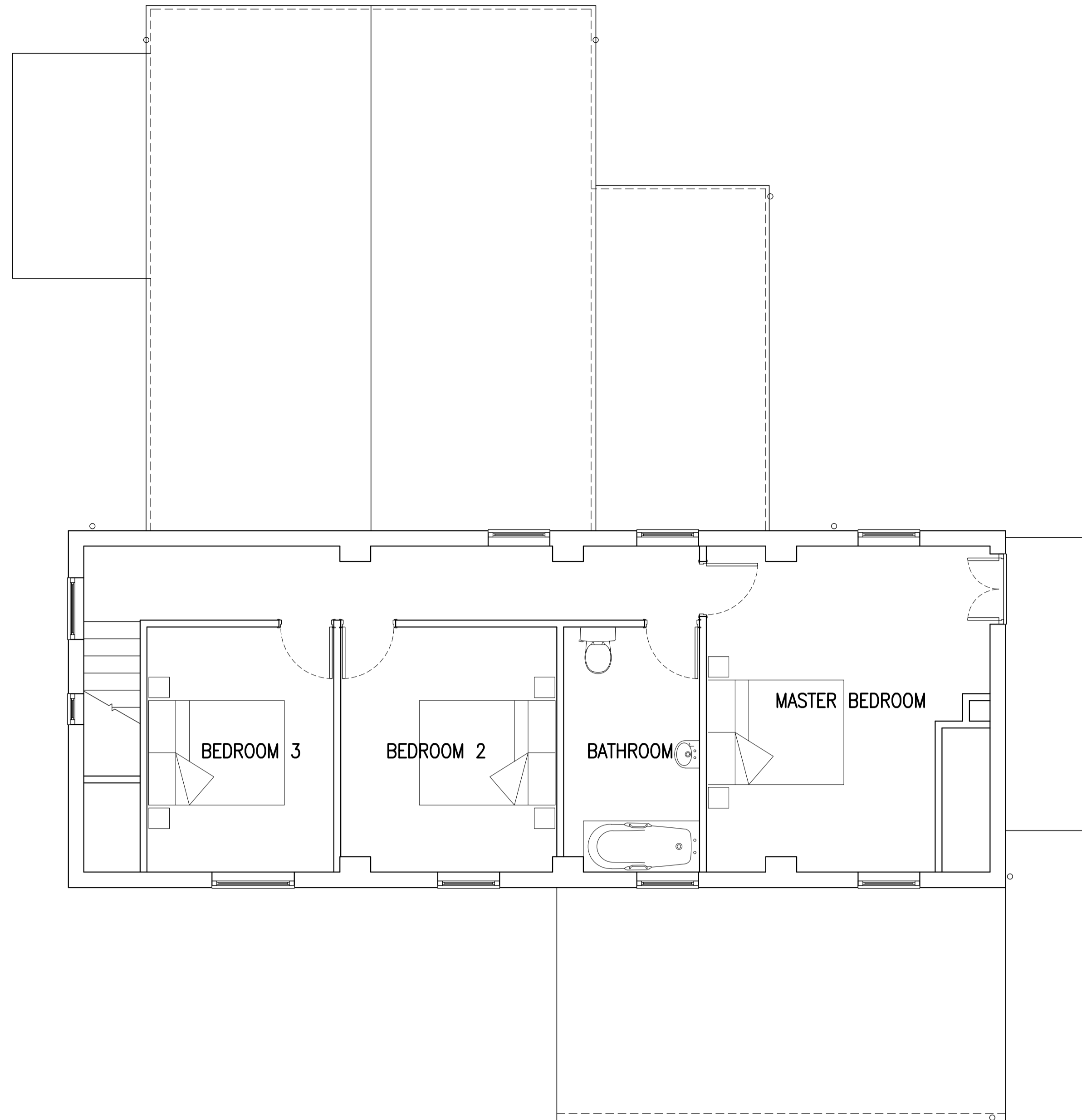
FIRST FLOOR GENERAL ARRANGEMENT (1:50)