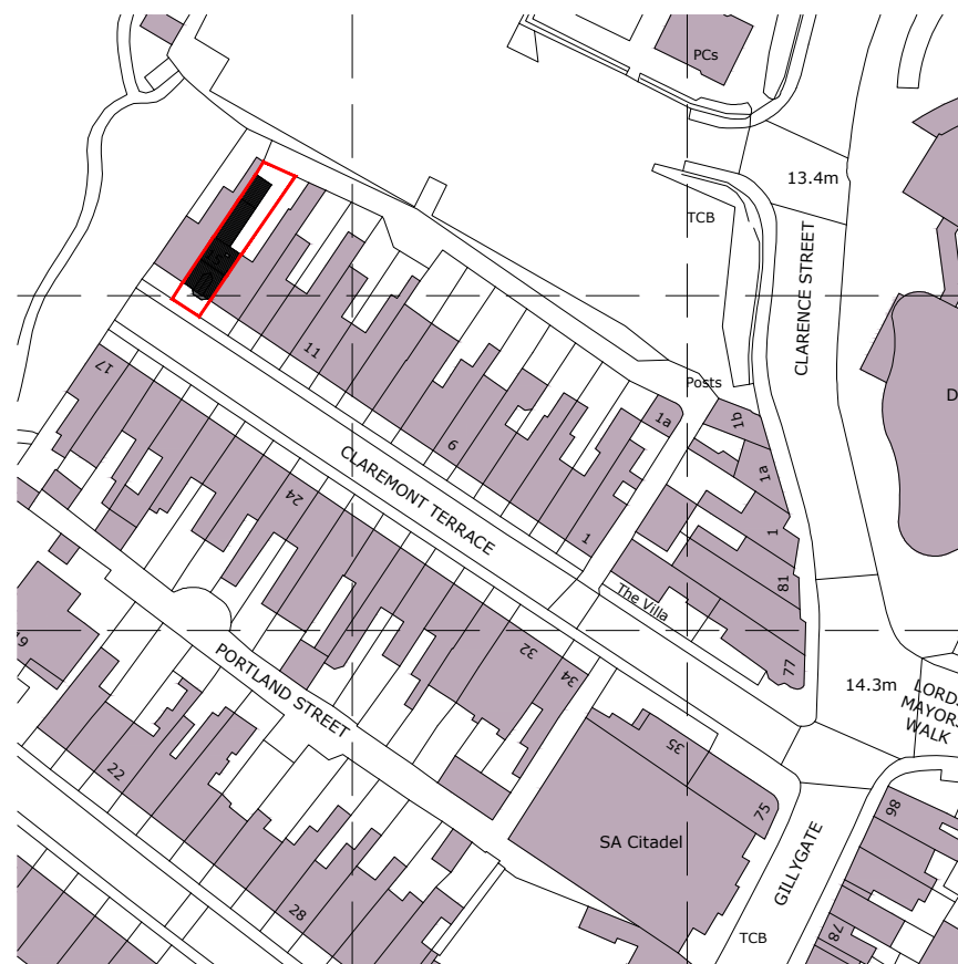
Location Plan (scale 1:1250)