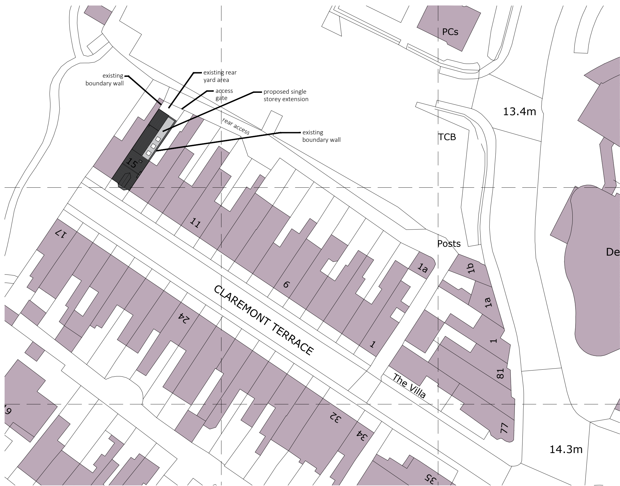
Proposed Site - Block Plan (scale 1:500)

This is Not an Architectural drawing. This drawing is for the purpose of obtaining Planning Permission only and is not to be used as working drawings. The drawings do not take into account any structural elements or calculations which must be obtained from a qualified Structural Engineer. All building, electrical, plumbing, heating & structural works to be carried out in conjunction with the relevant BS standards. Approval from a Building control officer & structural report from a structural engineer will be required. All building & services finer details, finishes & decorations to be agreed with the client & main contractor. All related building works, ground works & drainage works will require relevant investigation & testing to determine conditions & relevant works in line with BS standards & this to be agreed with a licensed building control officer. All work to be carried out in accordance with the building regulations and the requirements of the local authority. For health & safety information, refer to the main contractors health & safety risk assessments & method statements. The drawing is for information & pricing purposes only. All dimensions are to be double checked & verified onsite by the Main Contractor before any construction work commence. Do not scale this drawing.