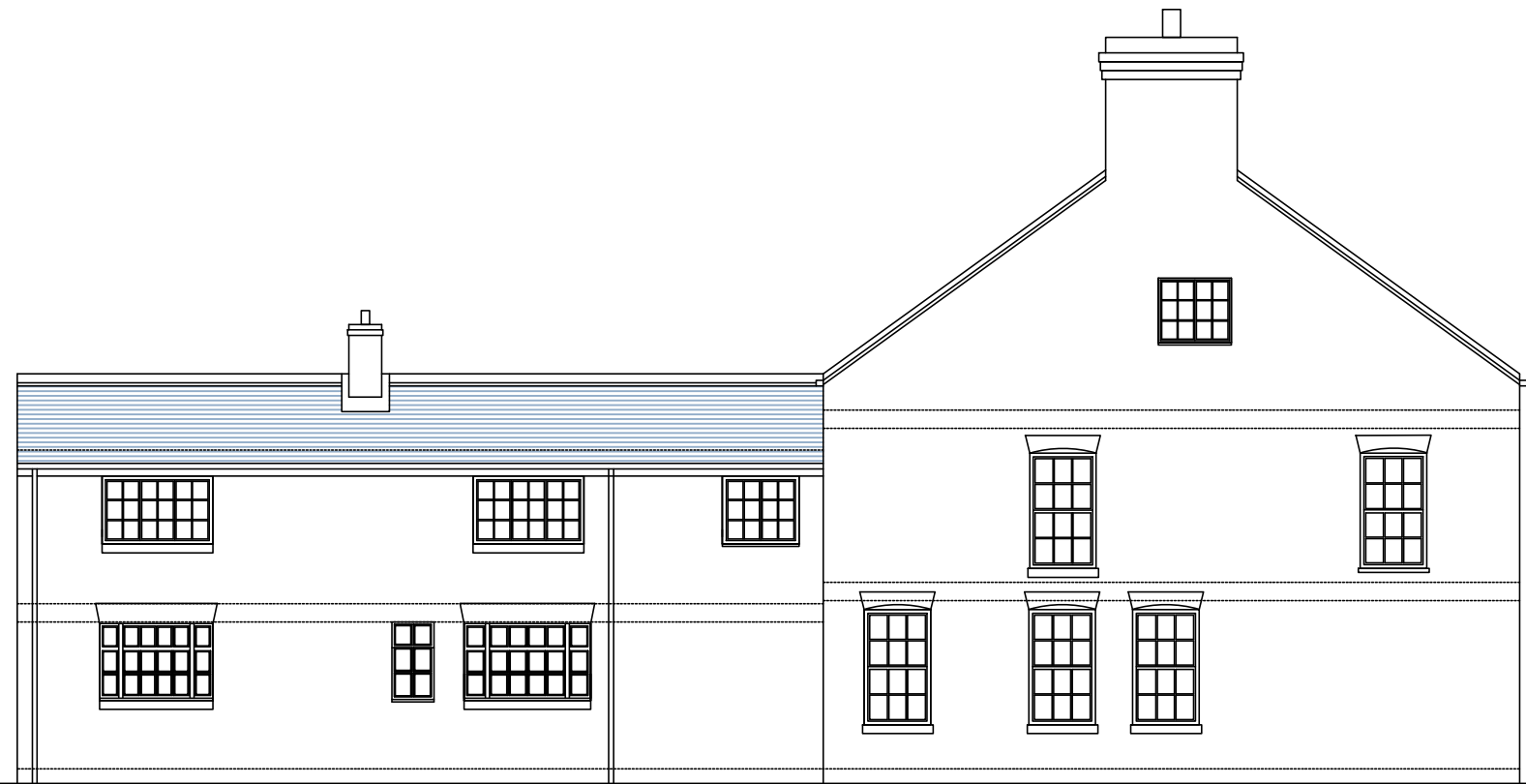
Elevation to North West