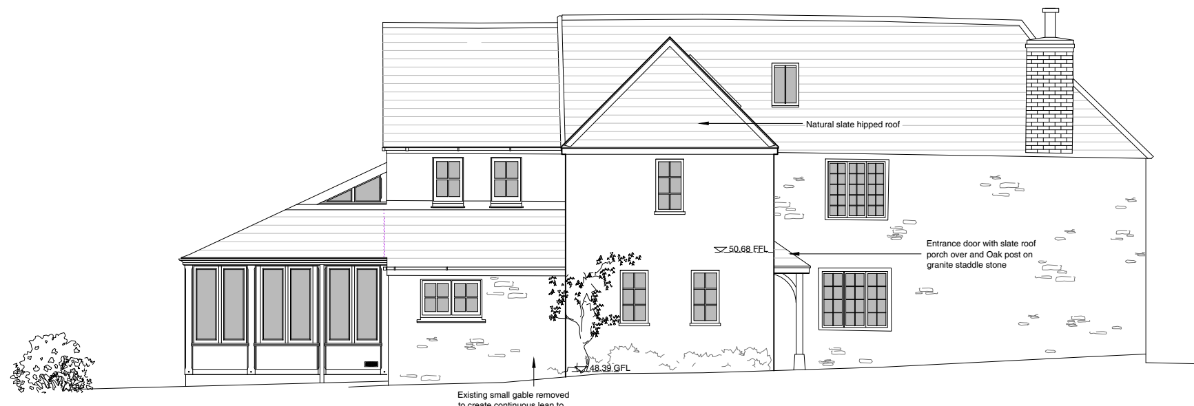
01 West Elevation - proposed Scale 1:100

6.0 5.0 4.0 3.0 2.0 1.0 0.0 -0.9 -1.0 -1.1 -1.2