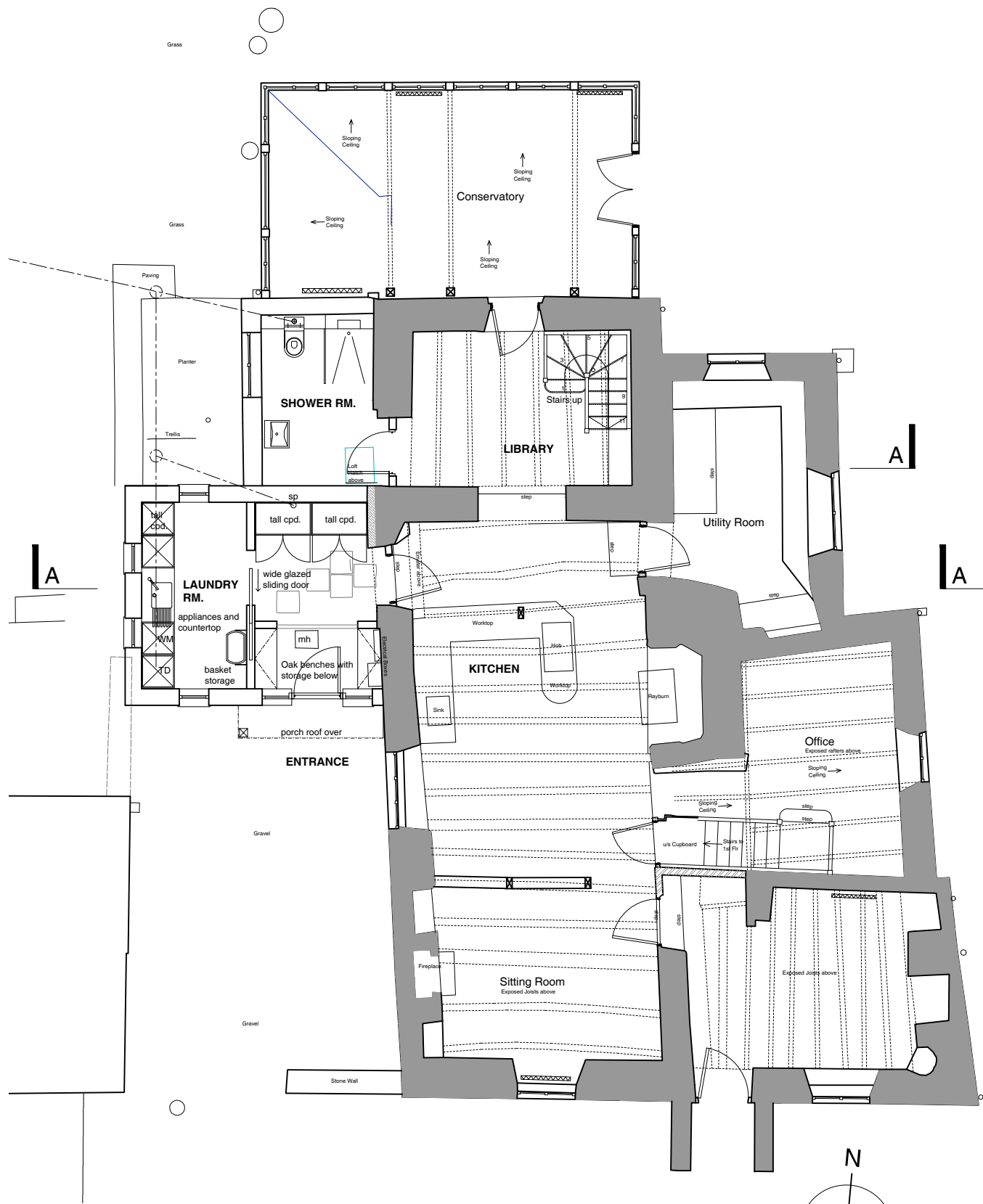
01 Ground Floor Plan Scale 1:100