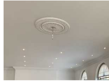
Existing ceiling rose to ground floor