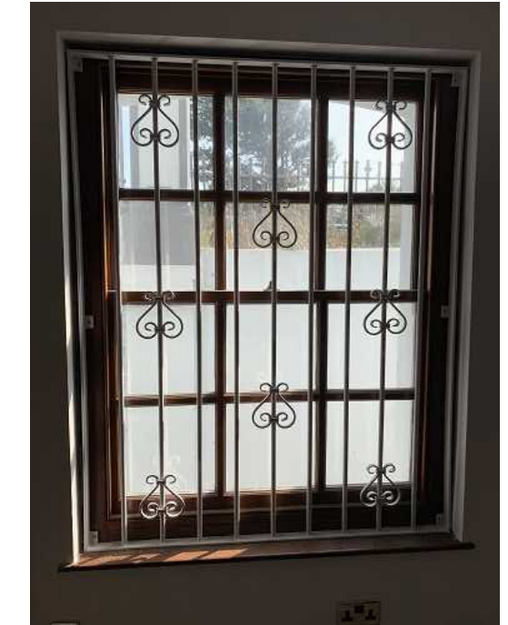
Existing windows to basement