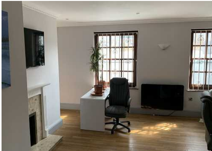
Typical windows and cornicing to basement