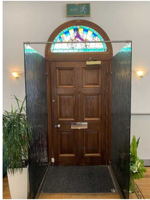
Existing ground floor main entrance door