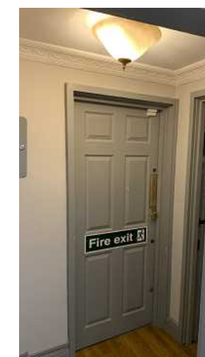
Existing panelled timber internal doors at ground floor level