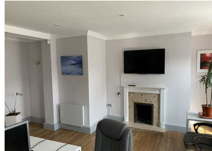
Existing basement fireplace