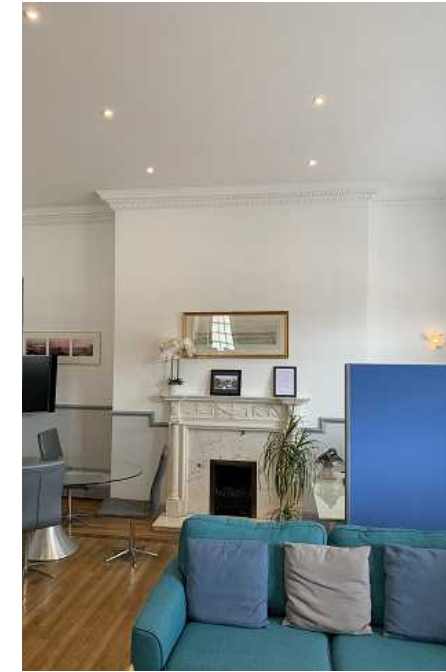
Existing ground floor fireplace on east facade