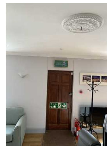
Existing basement entrance door