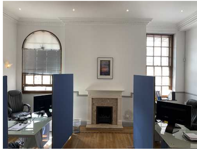
Existing ground floor fireplace on west facade