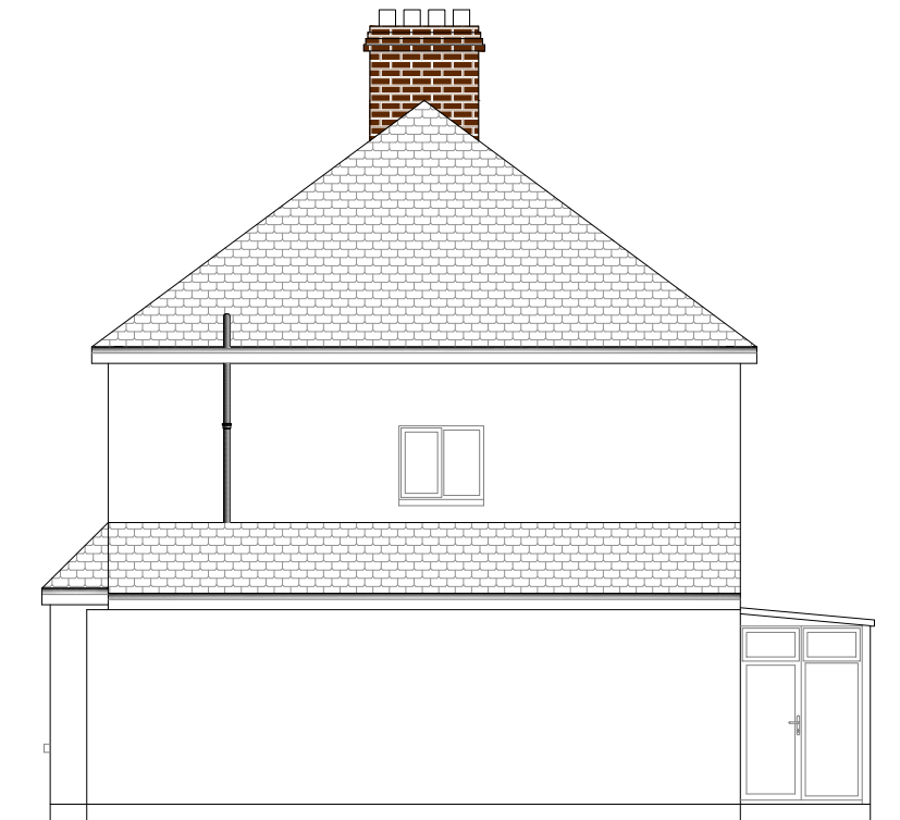
Existing Right Side Elevation Scale 1:100