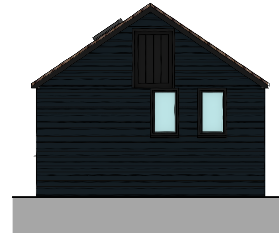
Existing Barn 1 East (Flank) Elevation