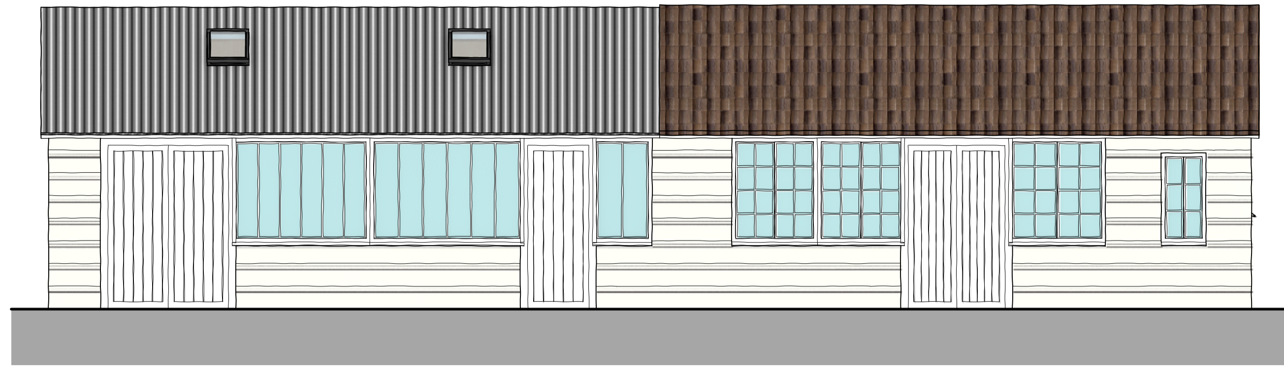
Existing Barn 1 South (Front) Elevation

Smart Architecture Ltd. Copyrights reserved. Do not scale from this drawing. All levels and dimensions to be checked on site by contractor. Any discrepancy to be verified by the Architect before proceeding. Drawing to be read in conjunction with all relevant SA drawings and specification clauses. The Contractor and relevant fabricated products to be built to current British and European Standards. This drawing must not be used for Land Transfer unless stated as 'Conveyance'. This drawing and its subject matter are the confidential property of Smart Architecture Ltd and shall not be copied, reproduced, used or disclosed to others without the prior written authority of Smart Architecture Ltd.