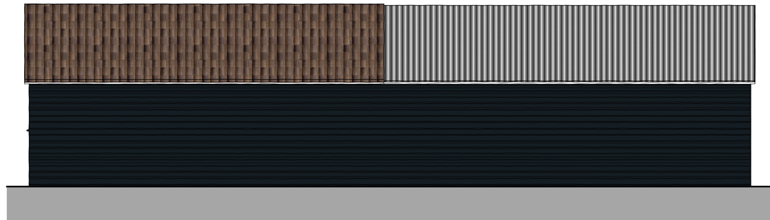
Existing Barn 1 North (Rear) Elevation