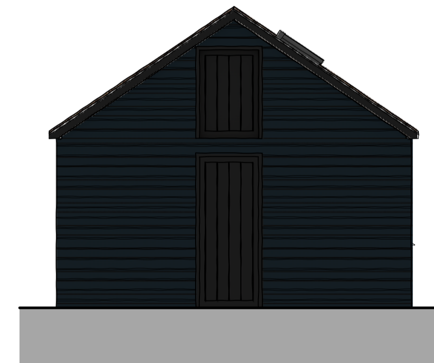
Existing Barn 1 West (Flank) Elevation