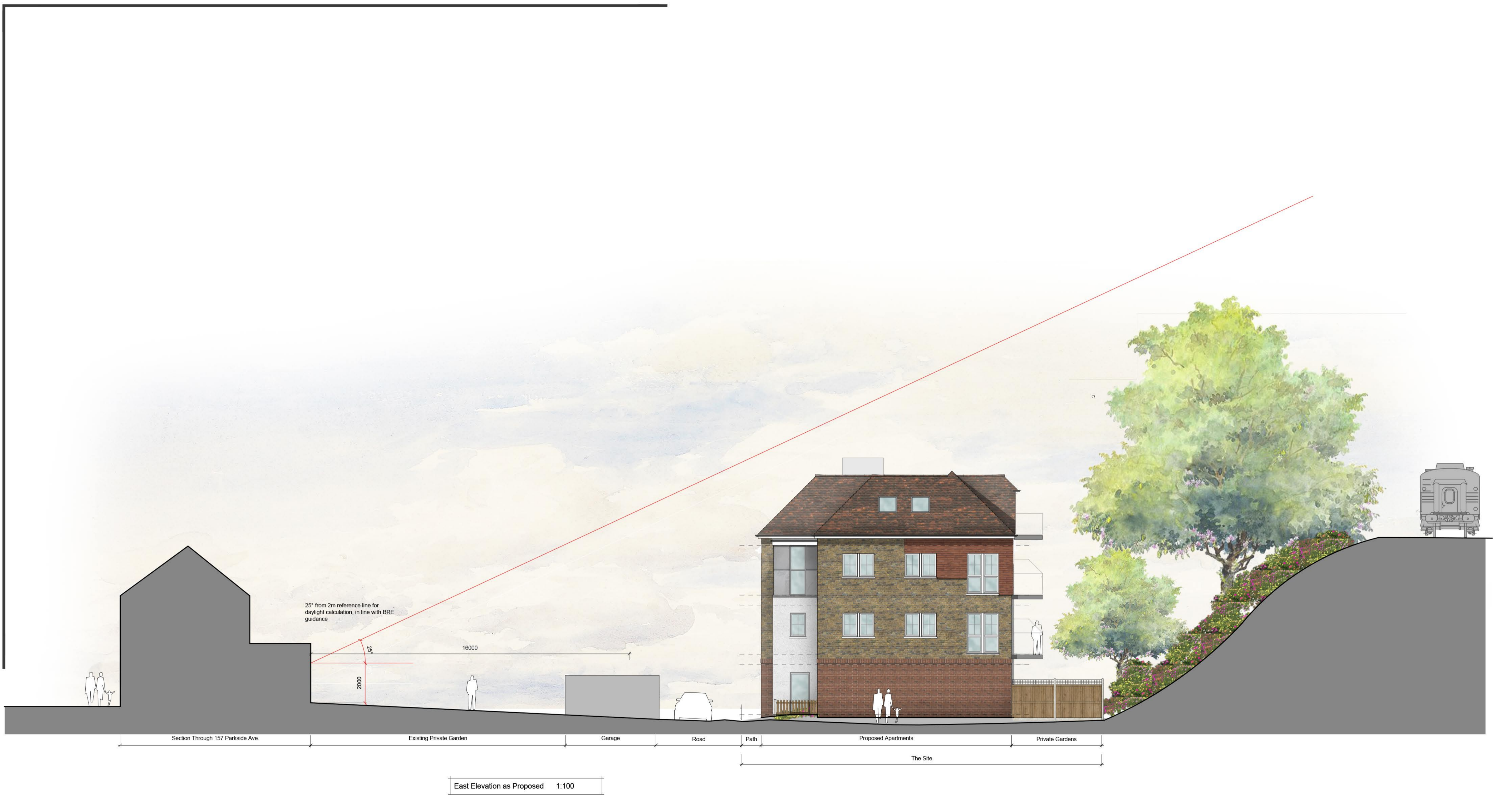
East Elevation as Proposed 1:100

Proposed Residential Development At Land to R/O 147-157 Parkside Avenue Bexleyheath