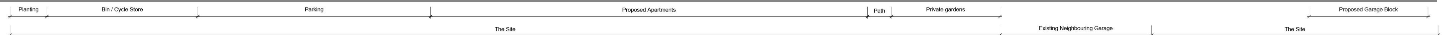
South Elevation as Proposed 1:100

Proposed Residential Development At Land to R/O 147-157 Parkside Avenue Bexleyheath Proposed South Elevation