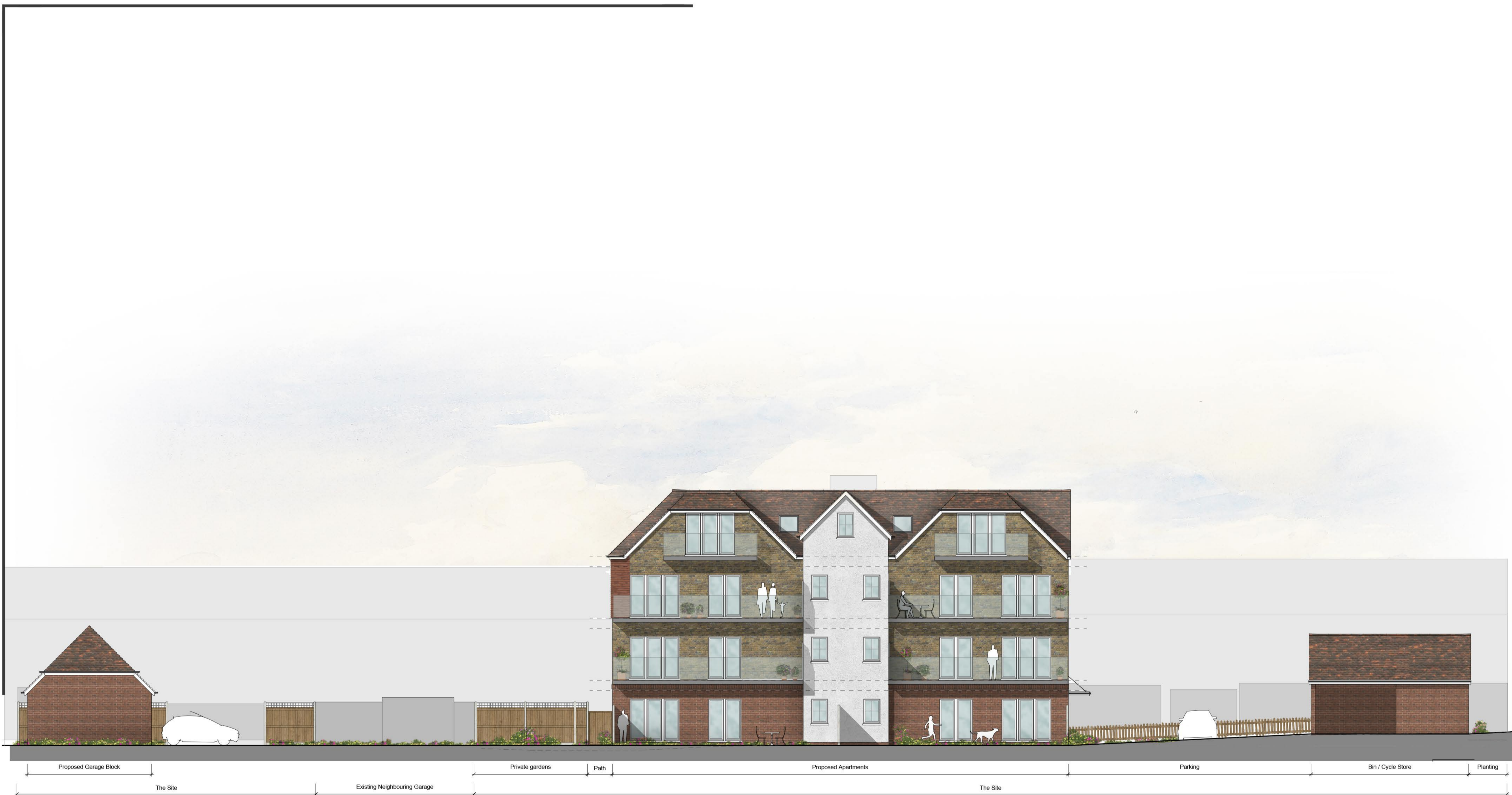
North Elevation as Proposed 1:100

Proposed Residential Development At Land to R/O 147-157 Parkside Avenue Bexleyheath