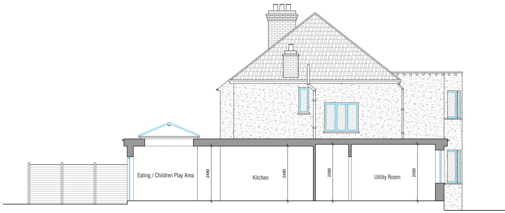
Section B - B