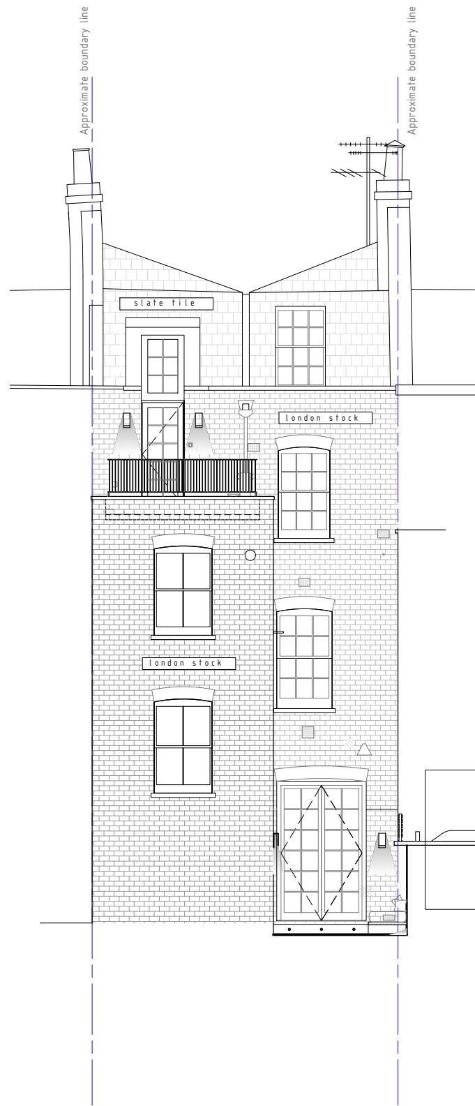
North East elevation (rear)