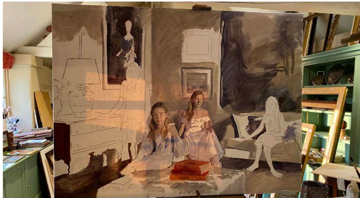
Sun Coming through into current studio impacting light conditions due to its orientation.

The ideal conditions for a studio are to have high North light. This is because the North light is the most consistent through out the day and at no point will light beam in to the room on to your canvas making it hard to see. It would be wonderful to have more width to the room to allow me to have large canvases with the life size subject matter/print out next to them. (This would mean a width of at least 4.5 metres). It would also be important for me to have the space to stand back at a distance to be able to properly view the painting as a whole. The new building would also allow for me to be able to employ an assistant who could work in the office space next door alongside my husband.