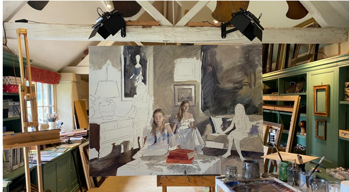
Studio size and orientation affects how the space is used and limits work on large canvas which is the medium most used.