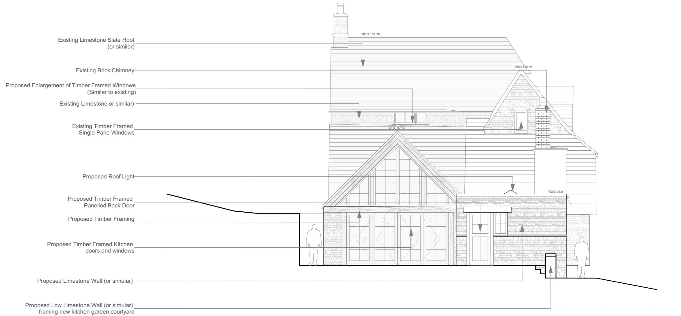
Farmhouse Proposed East Elevation