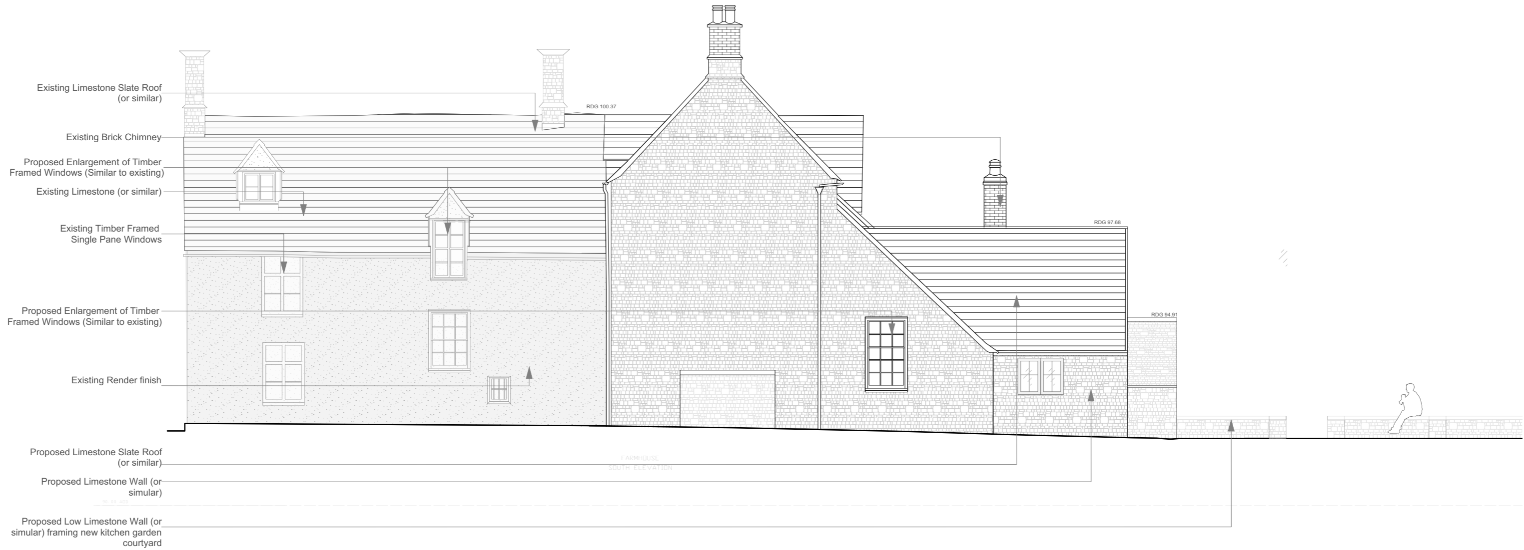
Farmhouse Proposed South Elevation