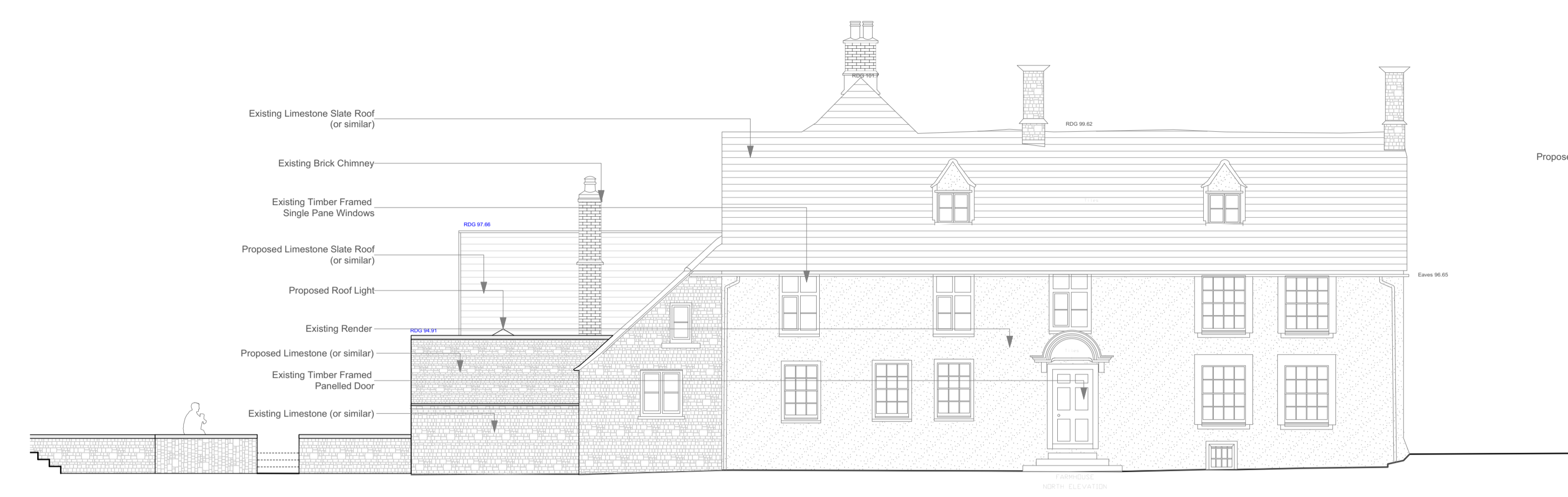
P/710 FARMHOUSE - PROPOSED SOUTH ELEVATION 1:100

General Notes 1. Responsibility is not accepted for errors made by others in scaling from this drawing. All construction information should be taken from figured dimensions only. 2. All dimensions to be checked onsite. 3. Unless otherwise stated dimensions are in millimetres. 4. Drawings to be read in conjunction with all other project drawings. 5. Copyright Millar + Howard Workshop Ltd. Rev. Date Notes Chartered Architects MILLAR + HOWARD WORKSHOP St Mary's Mill St Mary's Chalford STROUD Gloucestershire GL6 8NX t: 01453 887186 e: info@mhworkshop.co.uk w: www.mhworkshop.co.uk Project Title Holwell Farm Project Address Holwell Farm, Ozleworth Wotton-under-Edge, Gloucestershire, GL12 7QB Job No. 2101 Drawing Title Farmhouse Proposed Elevations Drawn By C/JG Checked By GL Date Sept 2021 Scale 1:100 @ A1 Drawing No. P/710 Revision - Drawing Status Planning