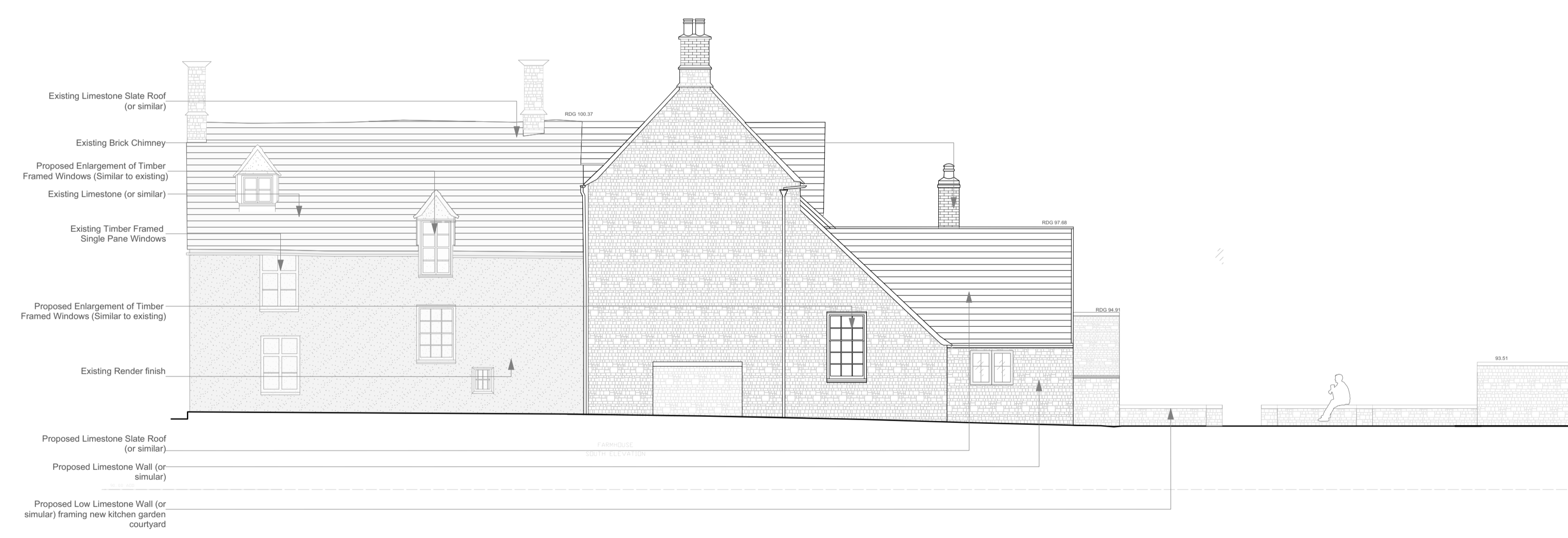
P/710 FARMHOUSE - PROPOSED NORTH ELEVATION 1:100