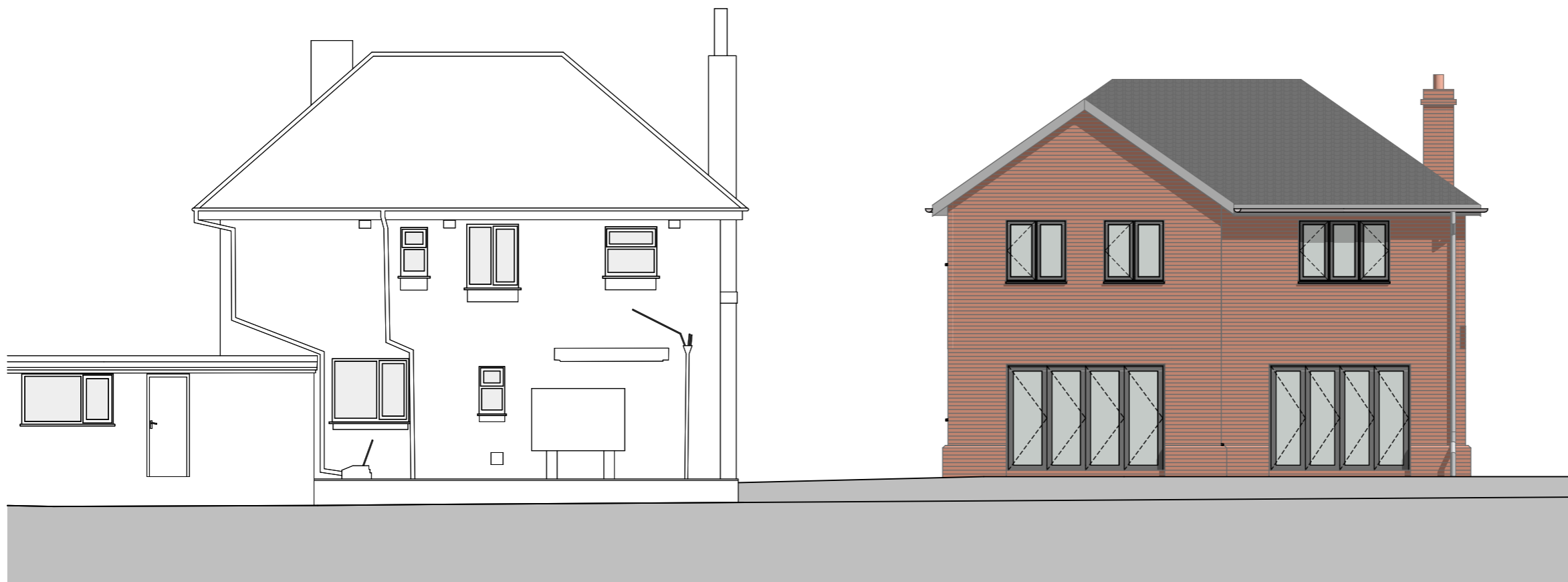
North Elevation & Street Scene