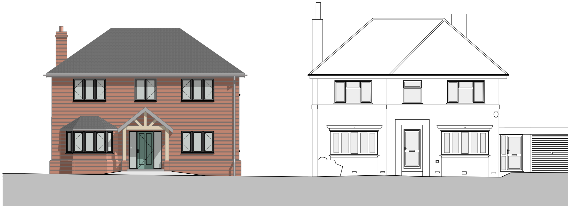
South Elevation & Street Scene