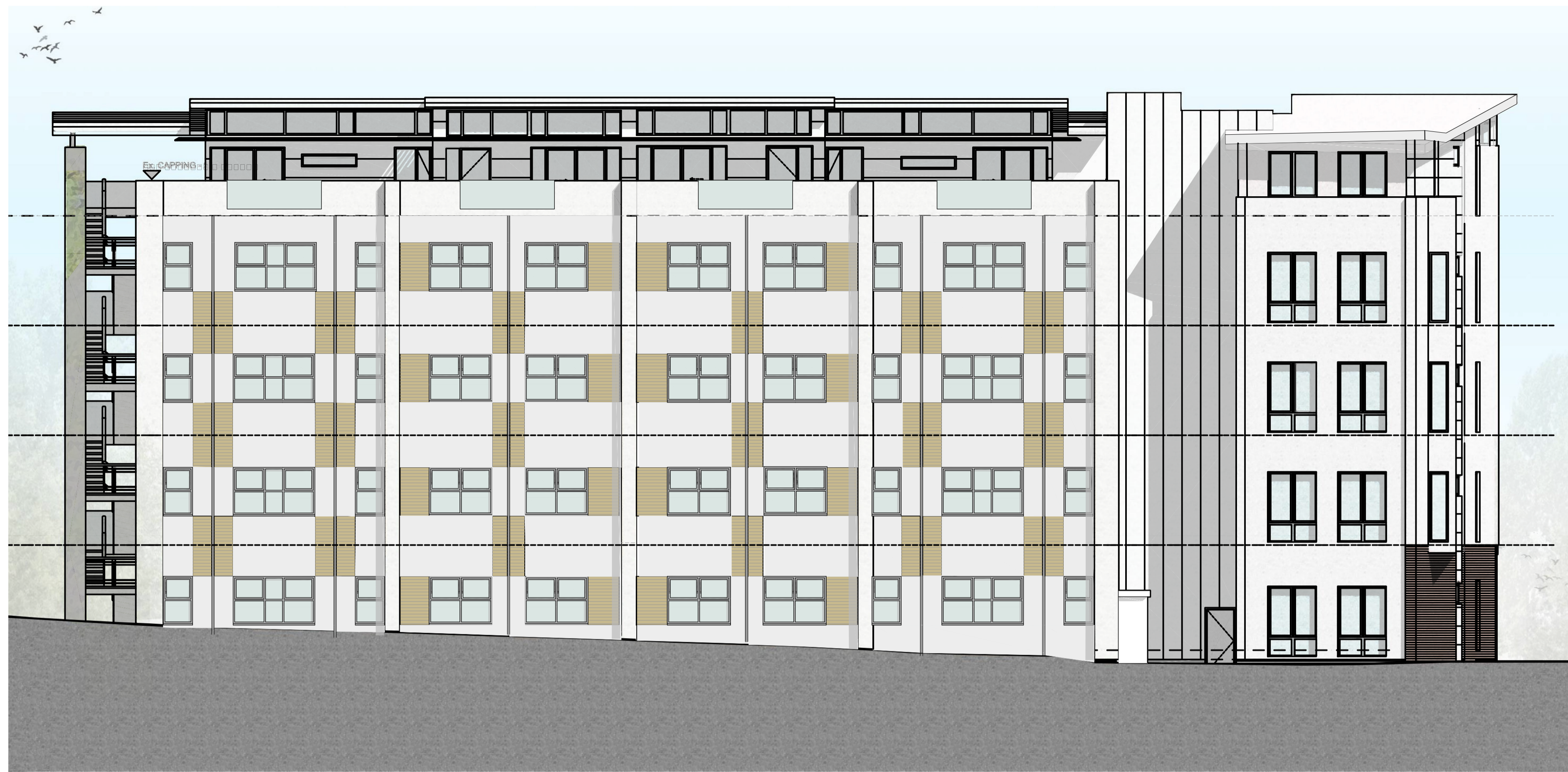
PROPOSED NORTH ELEVATION 1:100