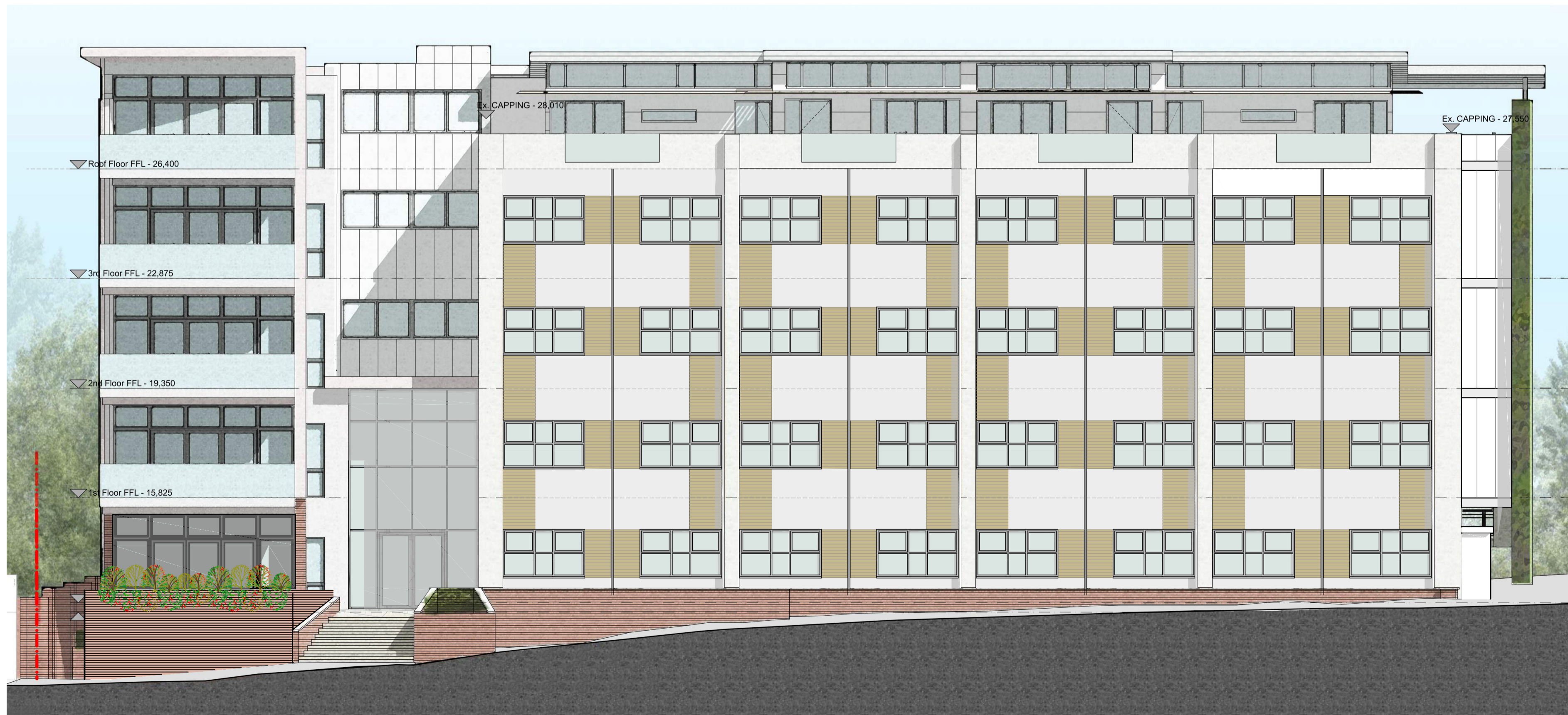
PROPOSED SOUTH ELEVATION 1:100