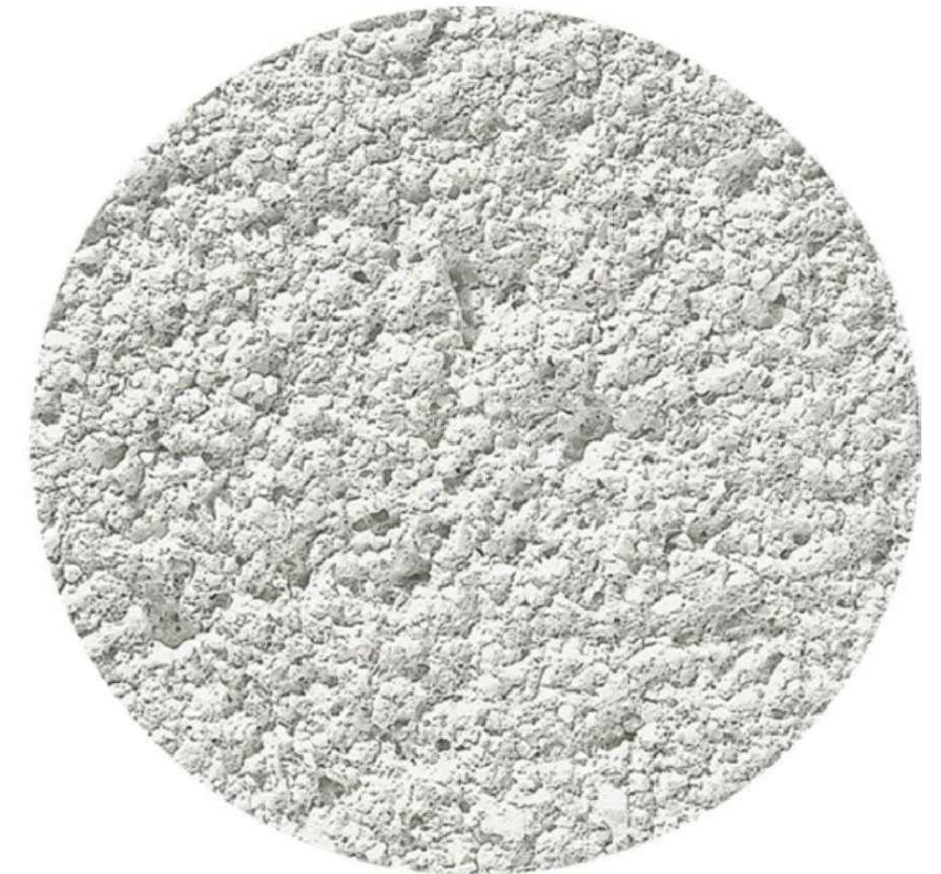
LIGHT GREY SELF COLOURED RENDERS TO WALLS