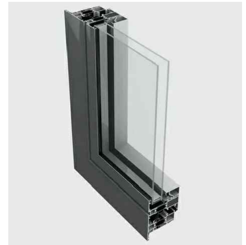
ALUMINIUM PROFILE WINDOWS FINISHED IN BLACK/GREY