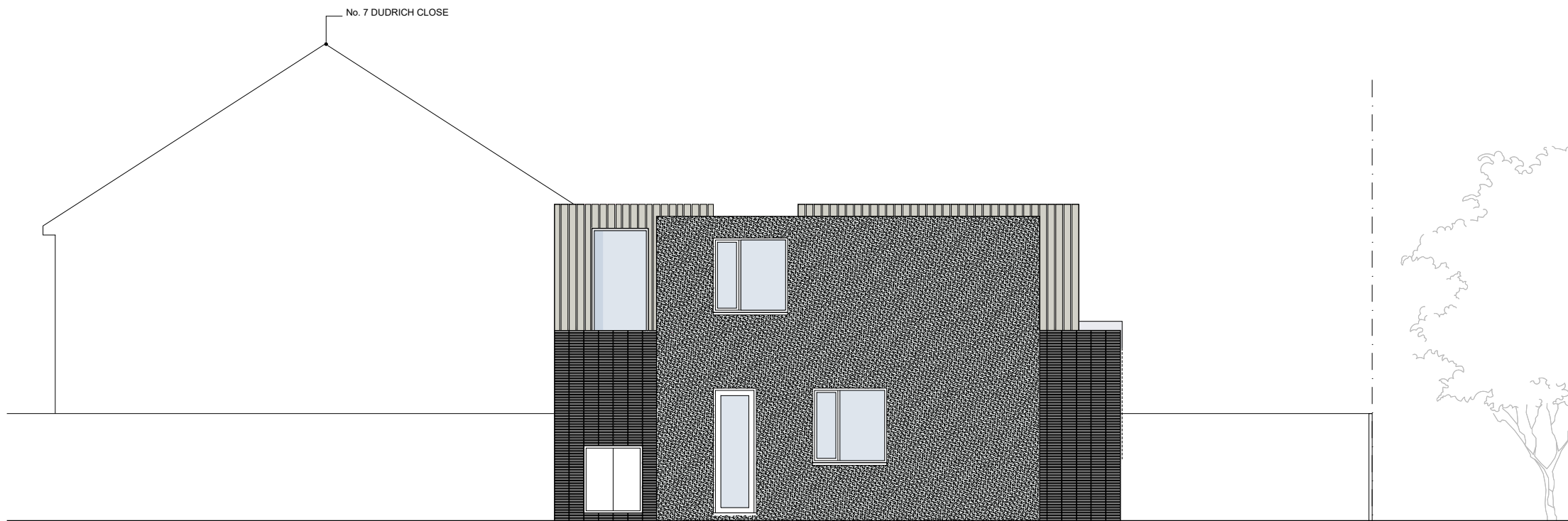
SIDE 2 ELEVATION