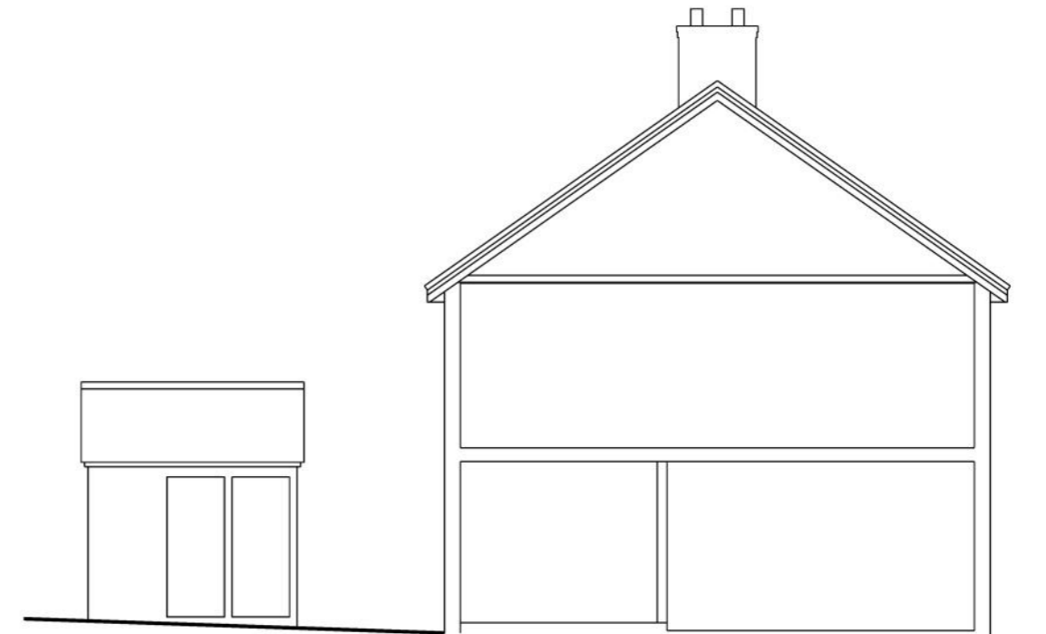
SECTIONAL SIDE ELEVATION (SOUTH)

concrete tiles pvcu windows pvcu windows facing brick notional ground level