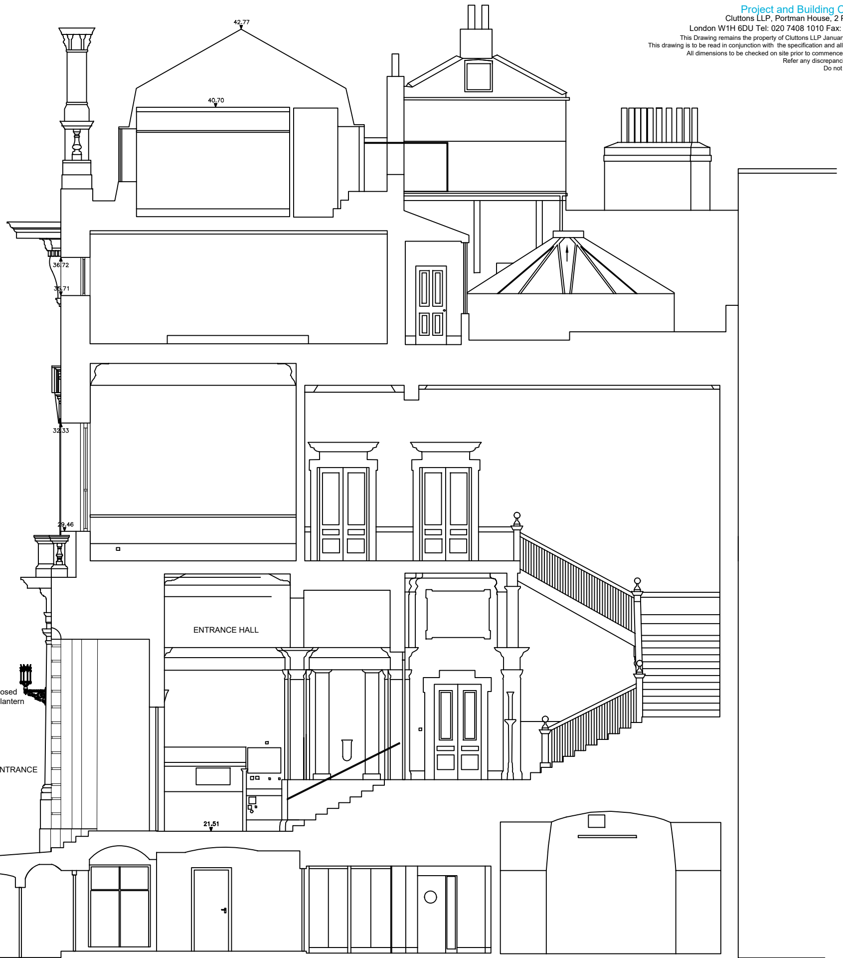
Section A - A