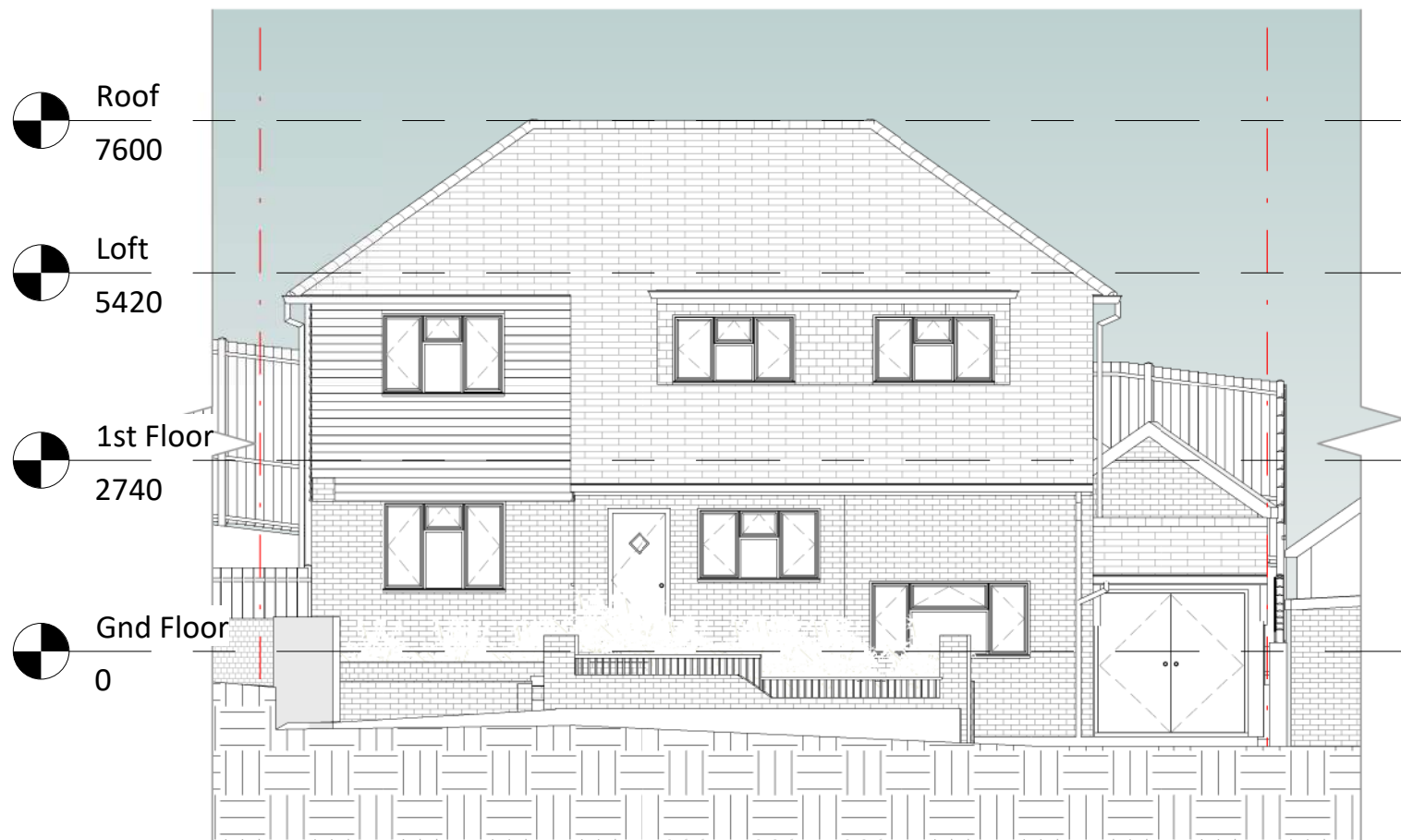
1 Existing front bounday wall 1 : 100