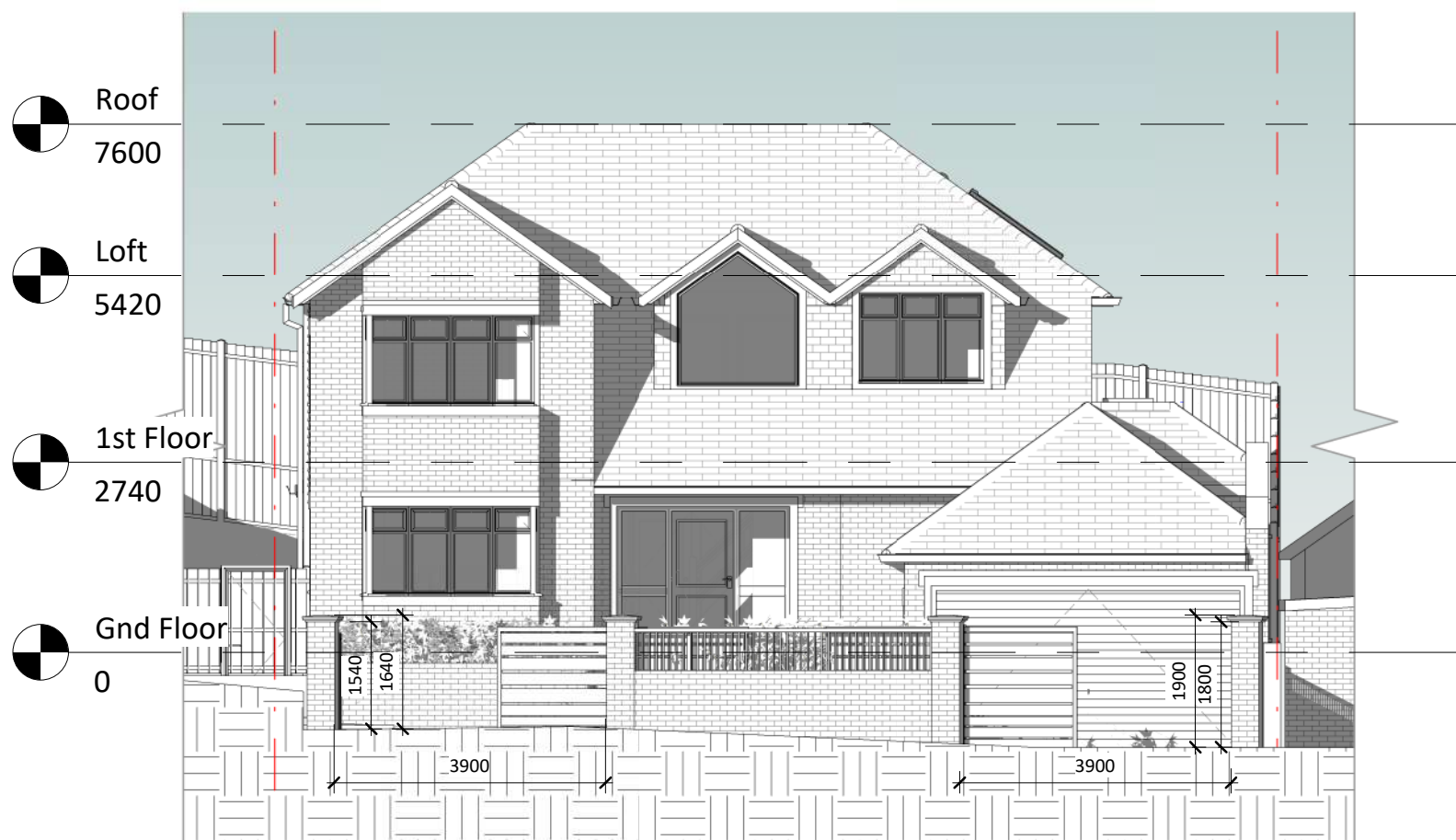
2 Proposed front bounday wall & gates 1 : 100